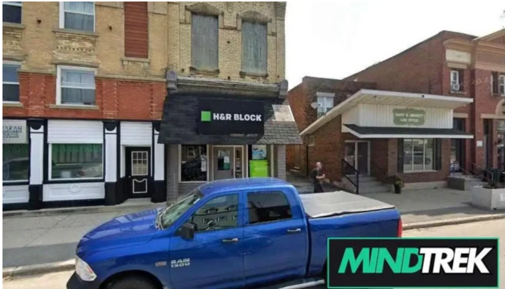
Co operators macdermid associates 2012 inc glencoe