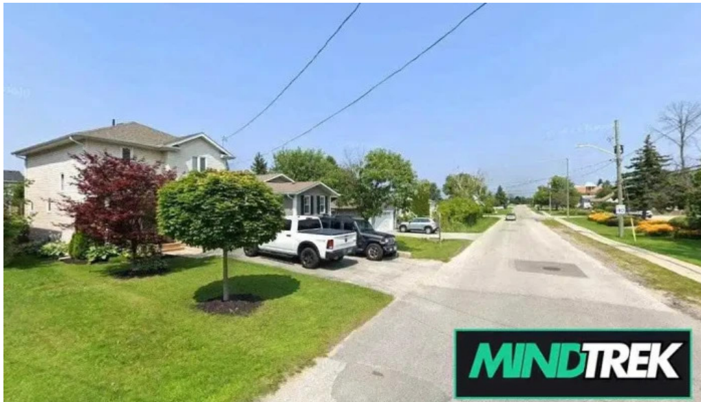
Georgian bay family health team collingwood