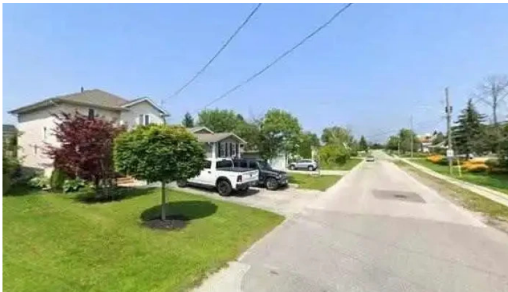
Georgian bay family health team all