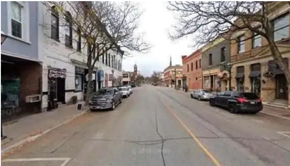
Jewls of osteopathy street view 360deg