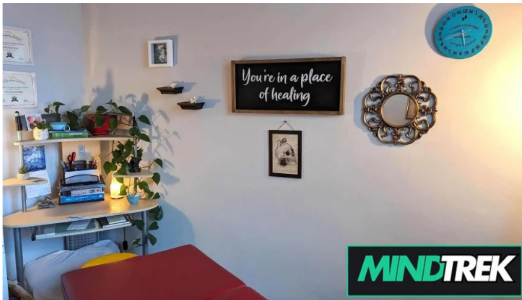
Jewels of osteopathy orillia