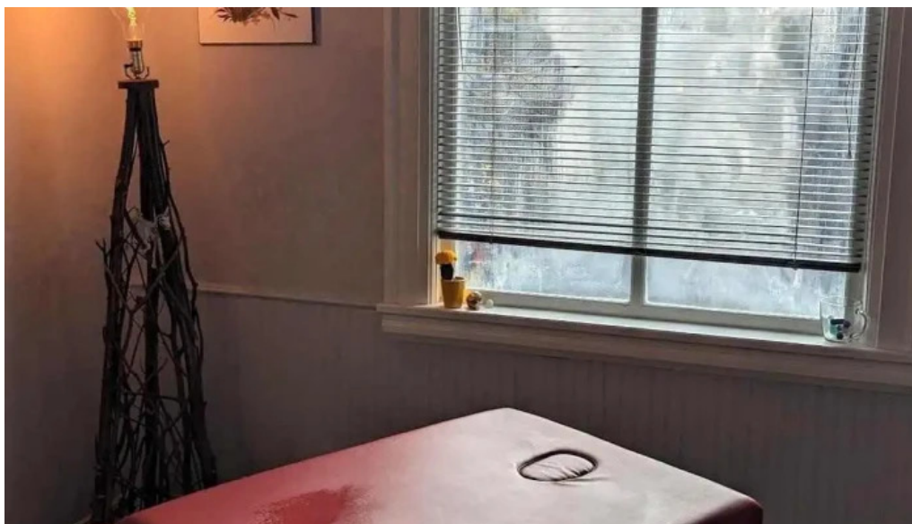
Jewls of osteopathy by owner