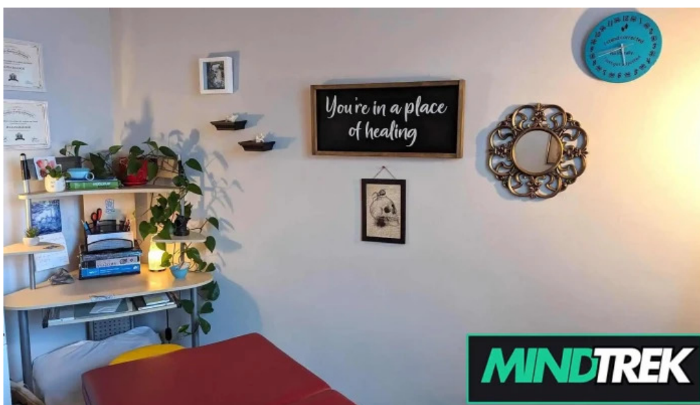
Jewls of osteopathy all