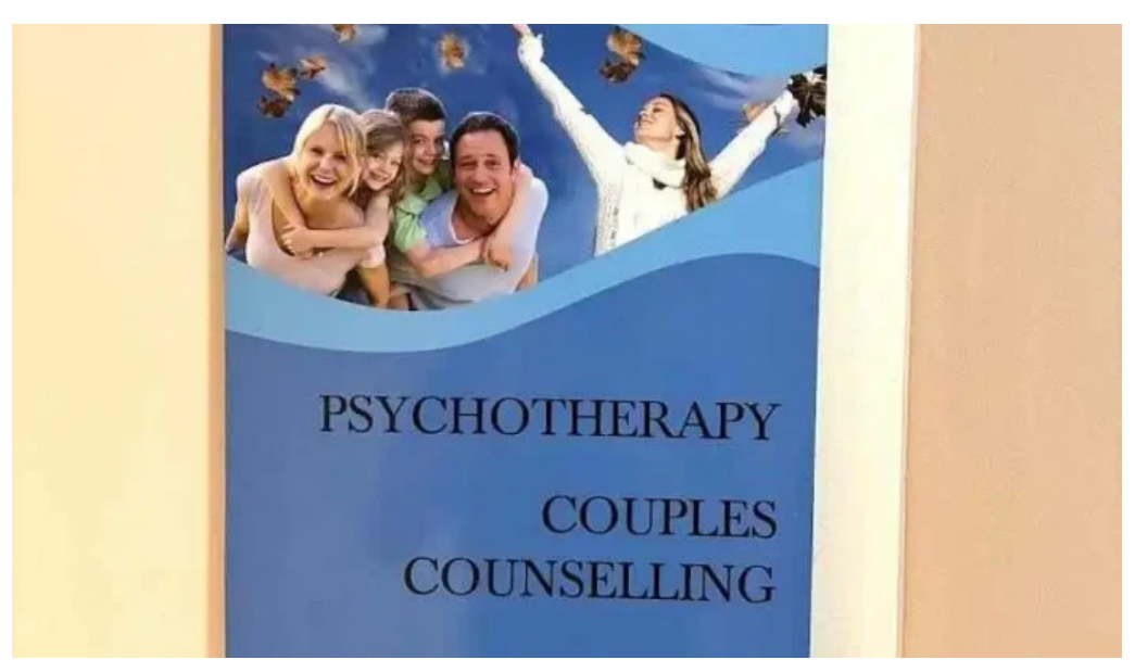
Rosen couples counselling concord