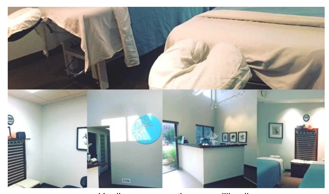
Healica massage therapy orillia all