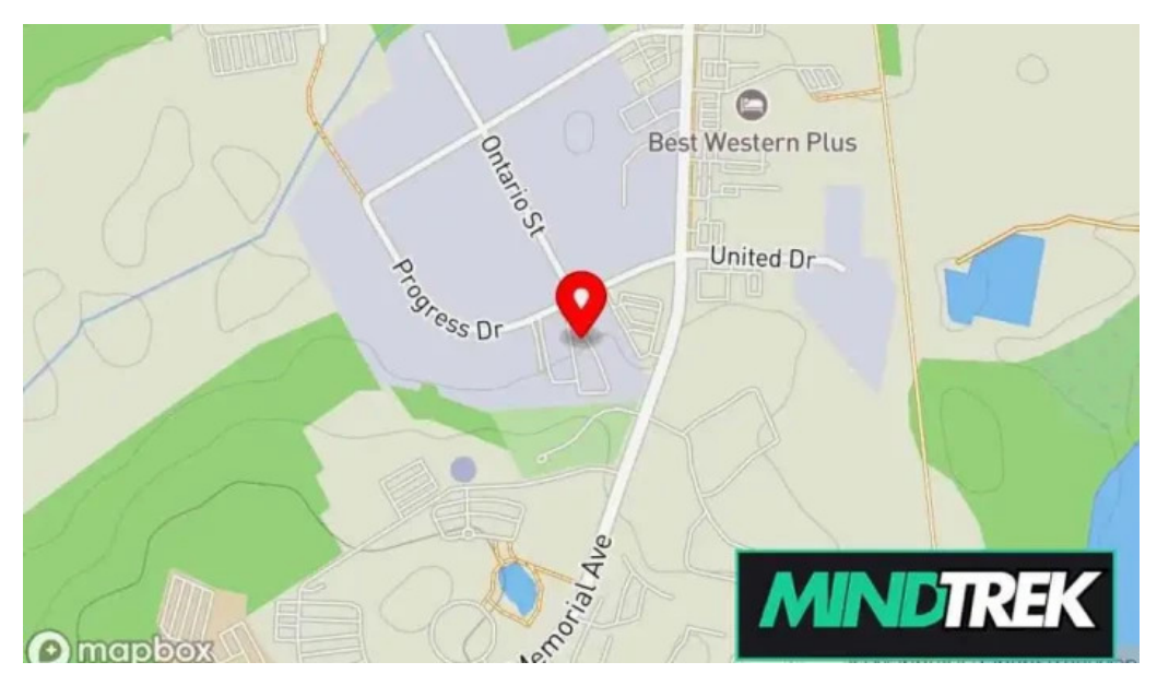
Healica massage therapy orillia map