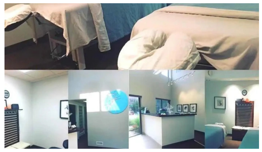
Healica massage therapy orillia orillia