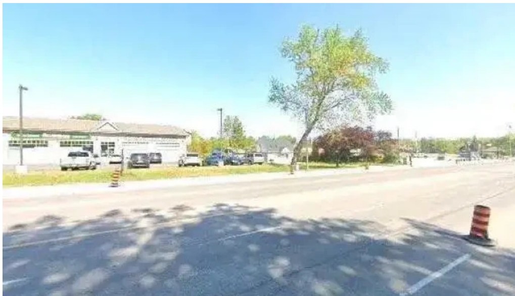
Angus therapeutics all