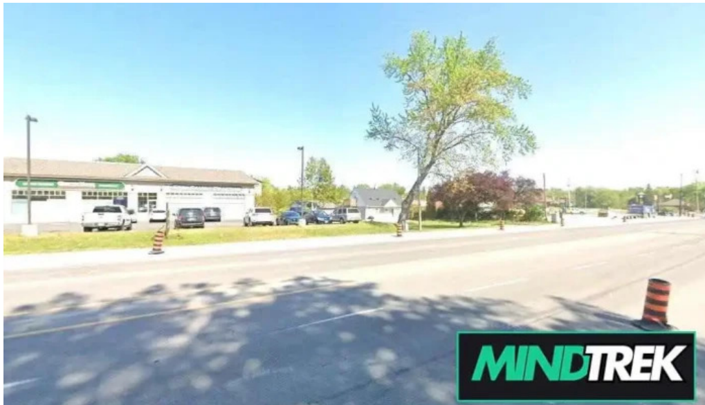
Angus therapeutics angus