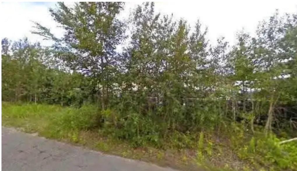
Cm massage therapy street view 360deg