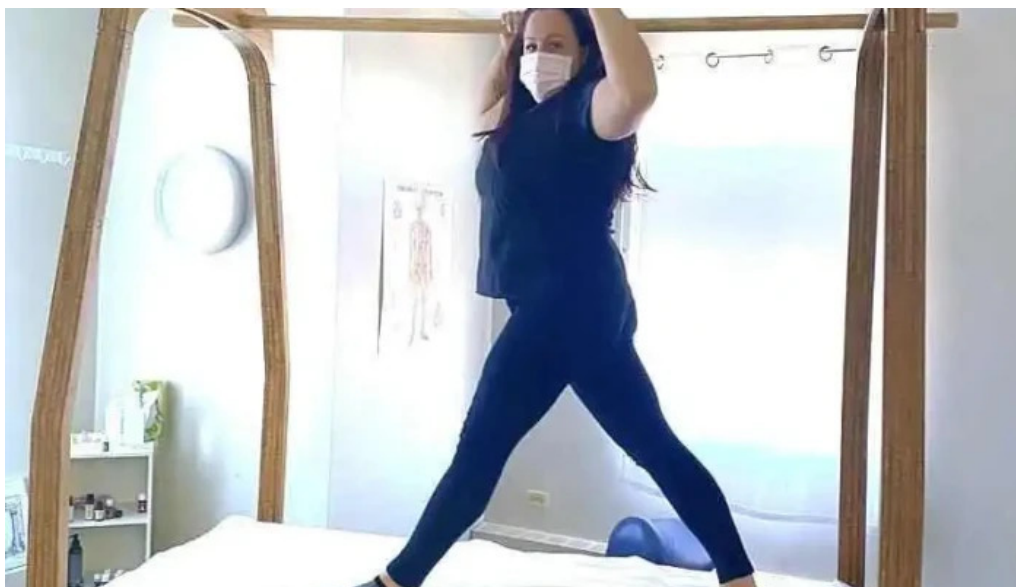
Cm massage therapy by owner