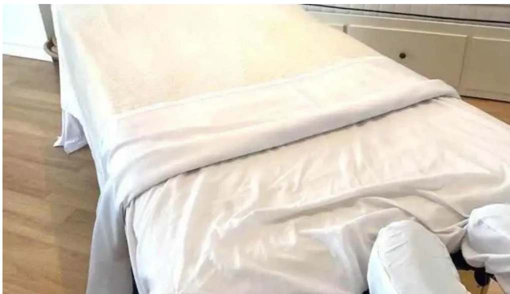
Cm massage therapy orillia