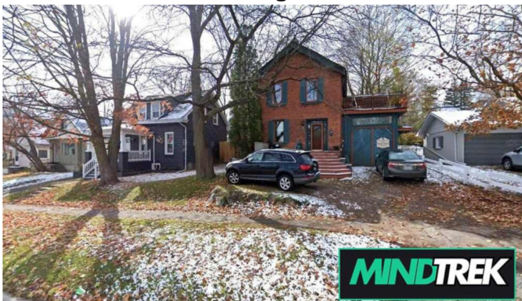
Huronia natural health orillia