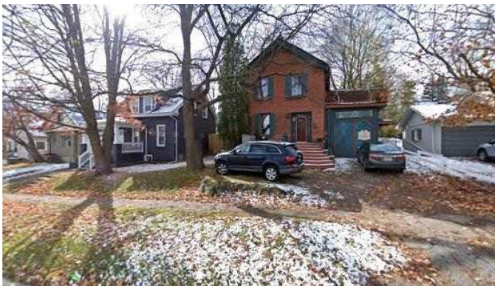
Huronia natural health all