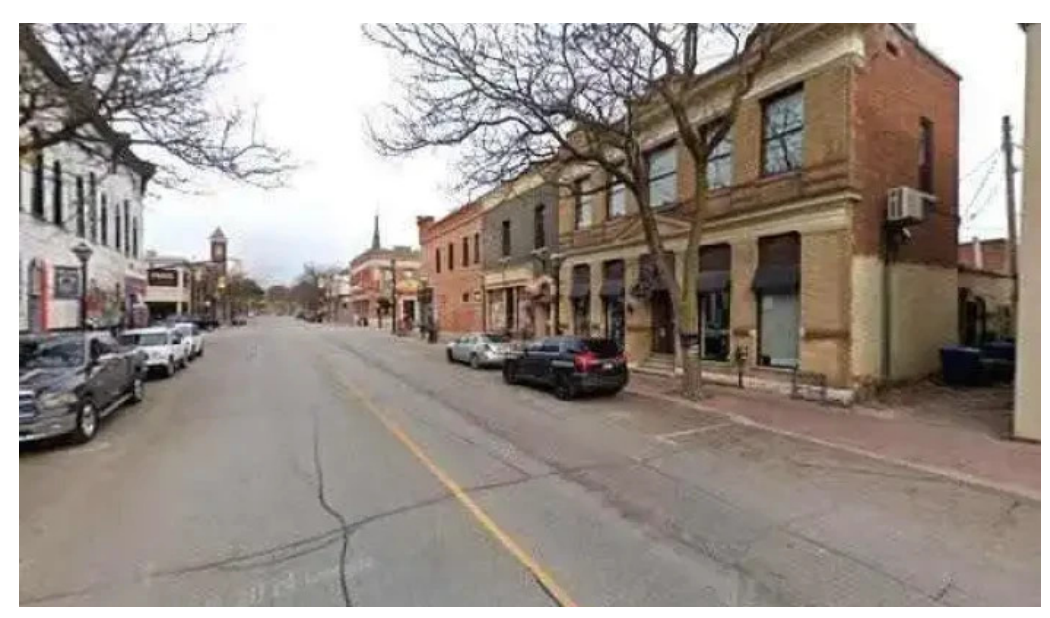
Proactive health care street view 360deg