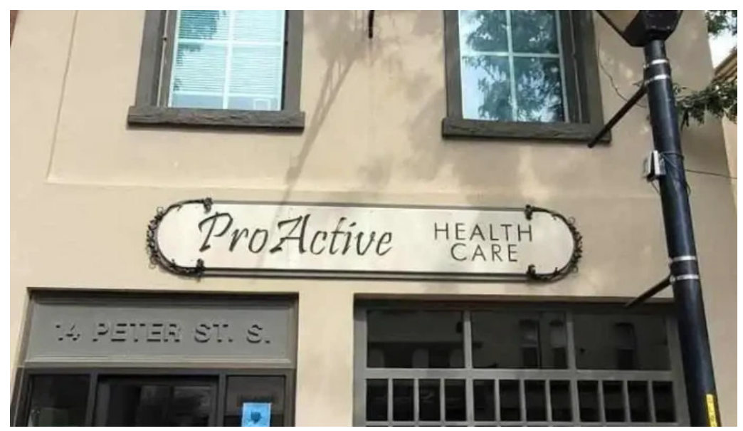
Proactive health care orillia