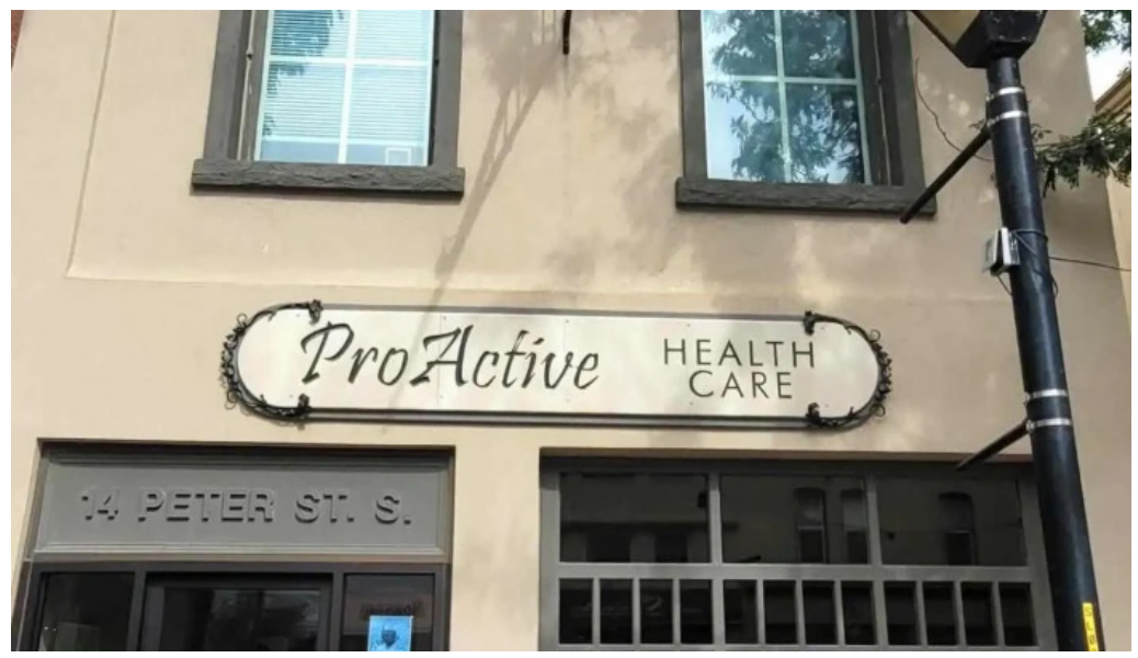
Proactive health care all