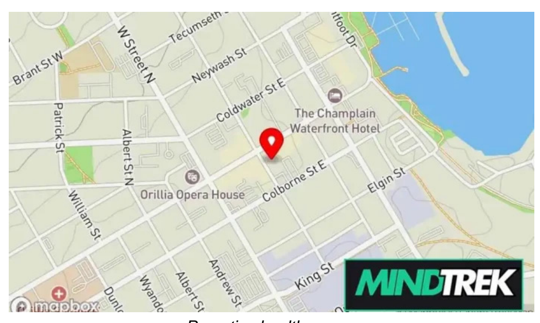
Proactive health care map