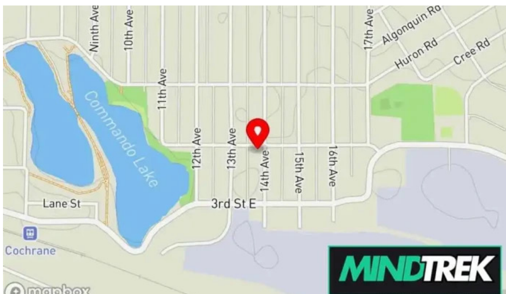
Rafacz wade wellness planner cochrane