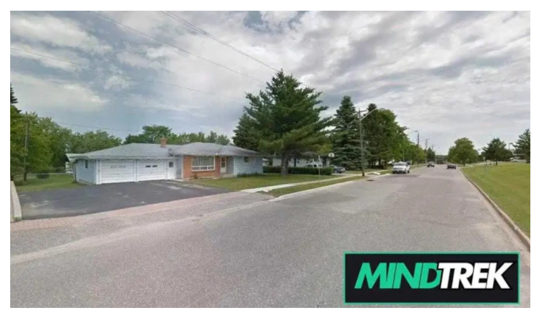
Dryden area family health team dryden