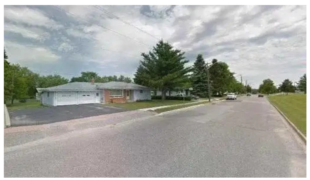
Dryden area family health team all