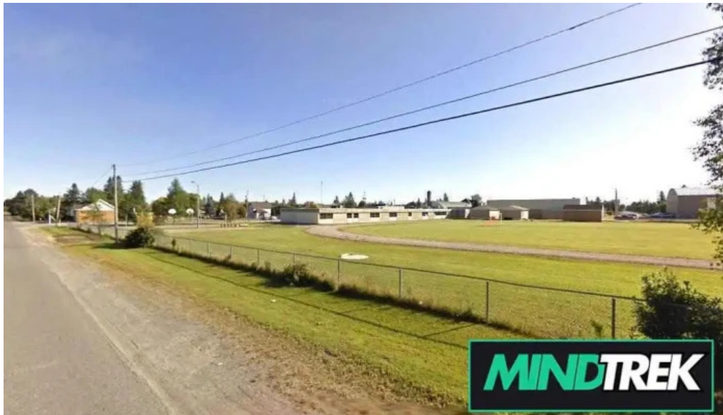
Englehart and district family health team englehart