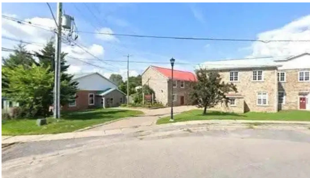
Leeds grenville rehab svc all