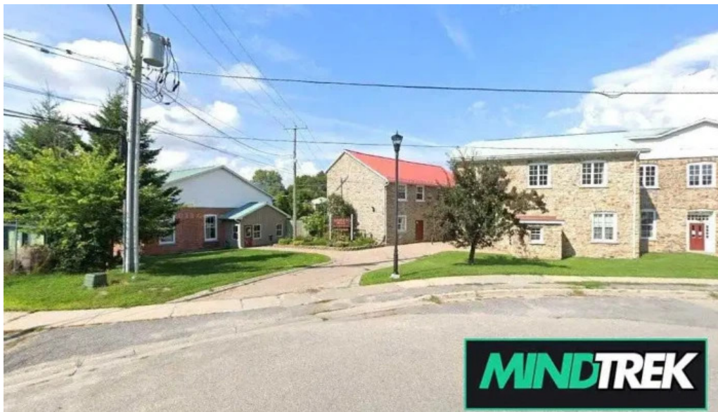
Leeds grenville rehab svc gananoque