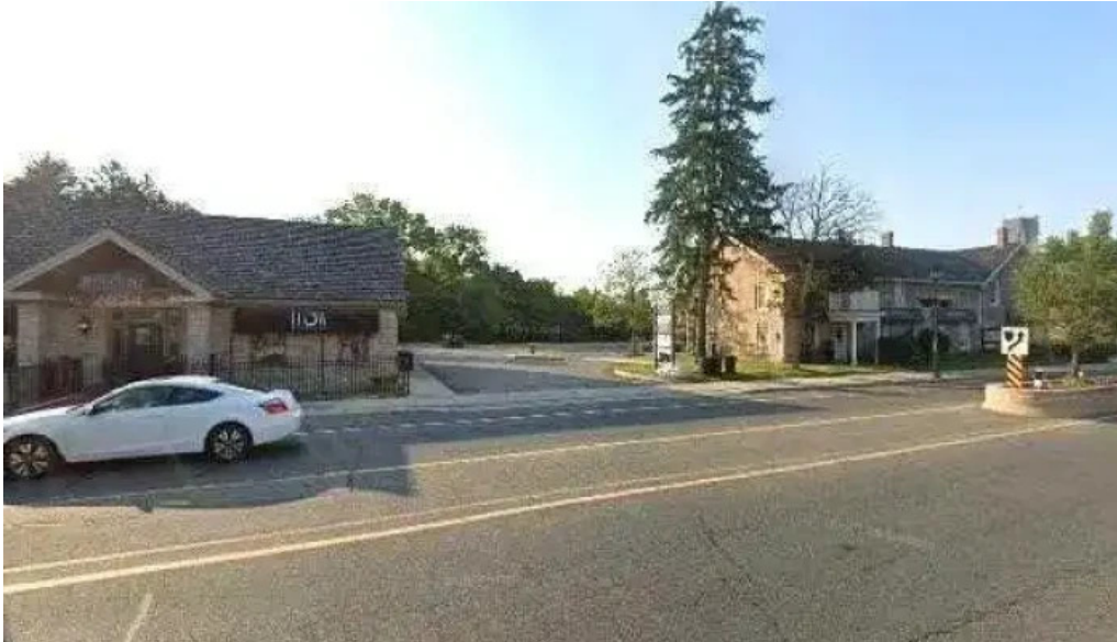
Simply serene psychotherapy street view 360deg