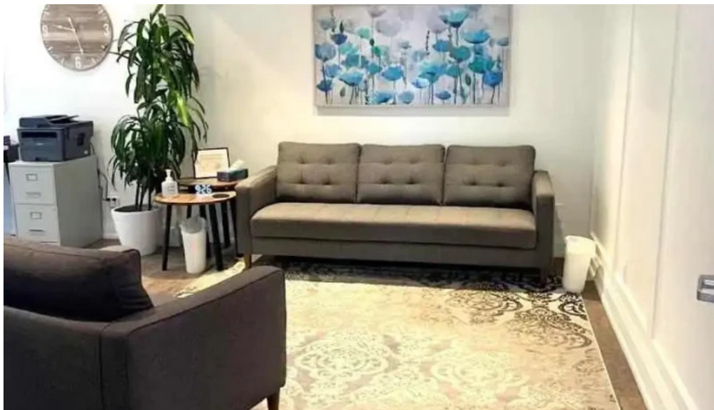
Simply serene psychotherapy ancaster