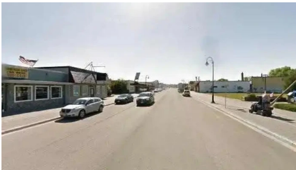
Atikokan community counselling services all