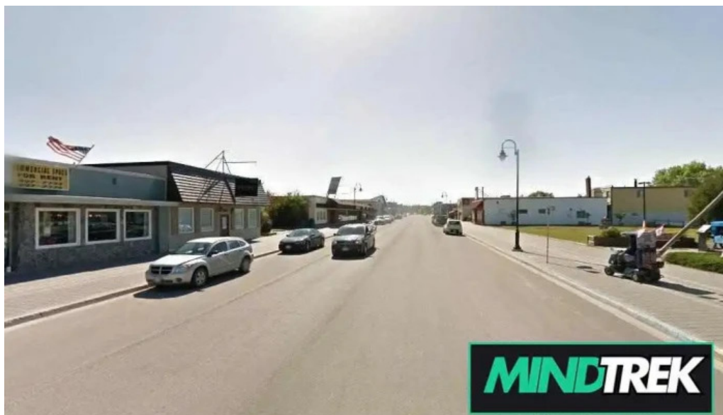
Atikokan community counselling services atikokan