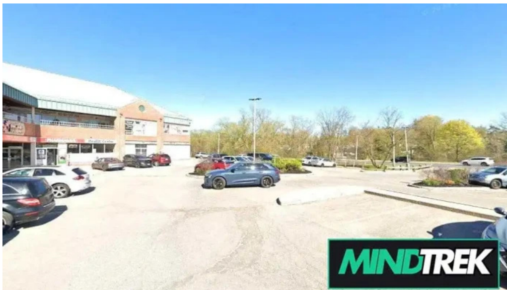
Telus health children support clinic aurora area aurora