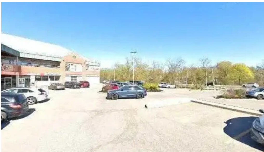
Telus health children support clinic aurora area all