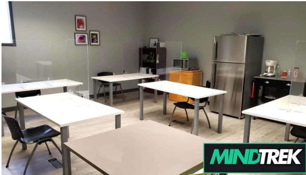
Enrichment centre for mental health by owner