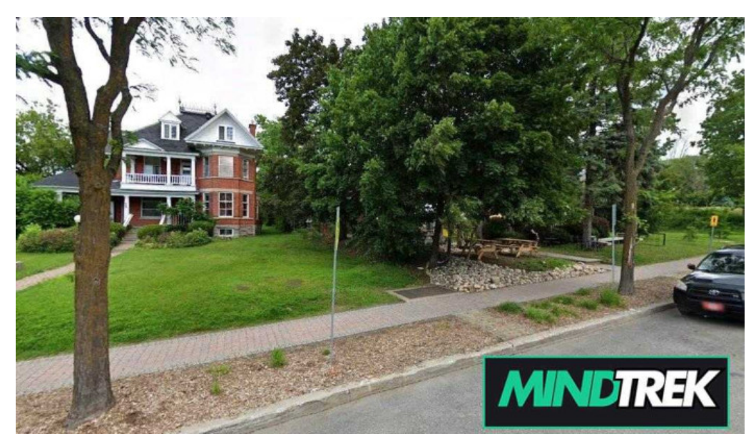
Clinique de sante mentale d aylmer gatineau