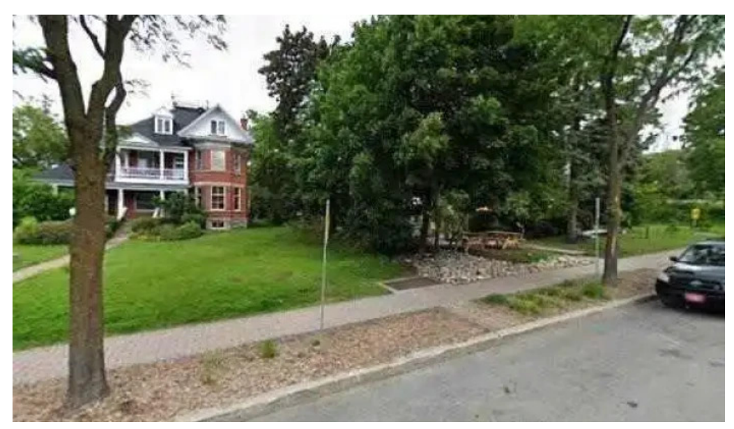
Clinique de sante mentale daylmer all