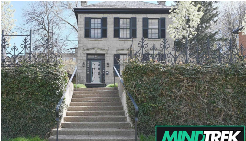
Bewell hamilton health centre all