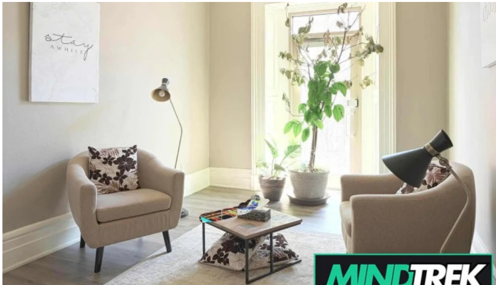
Bewell hamilton health centre by owner