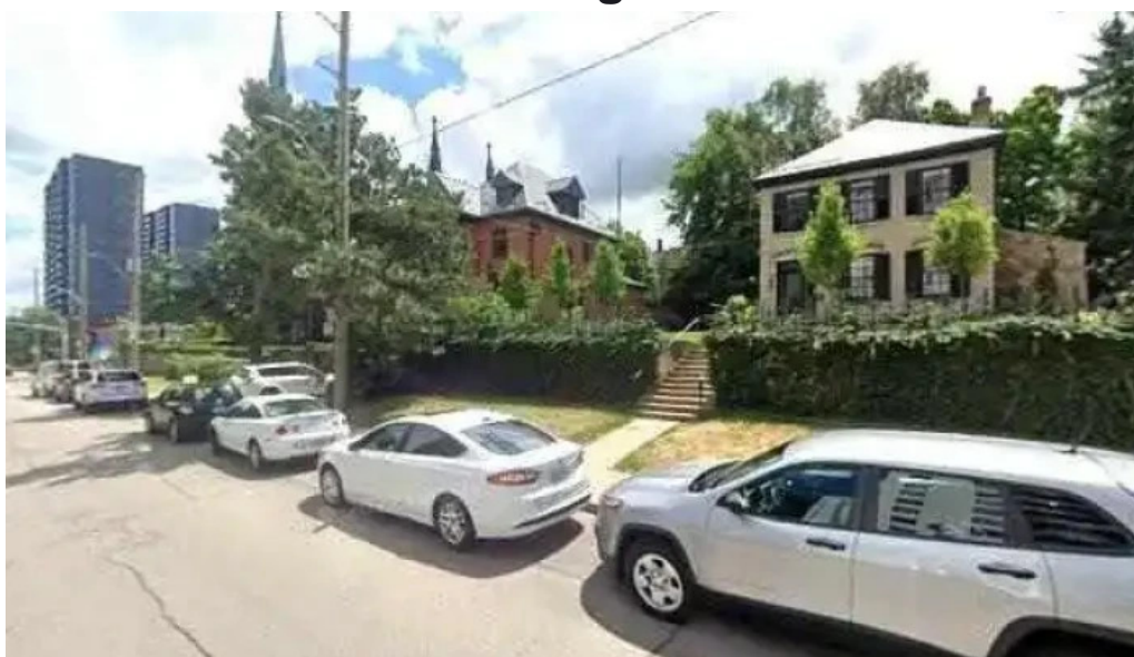
BeWell hamilton health centre street view 360deg