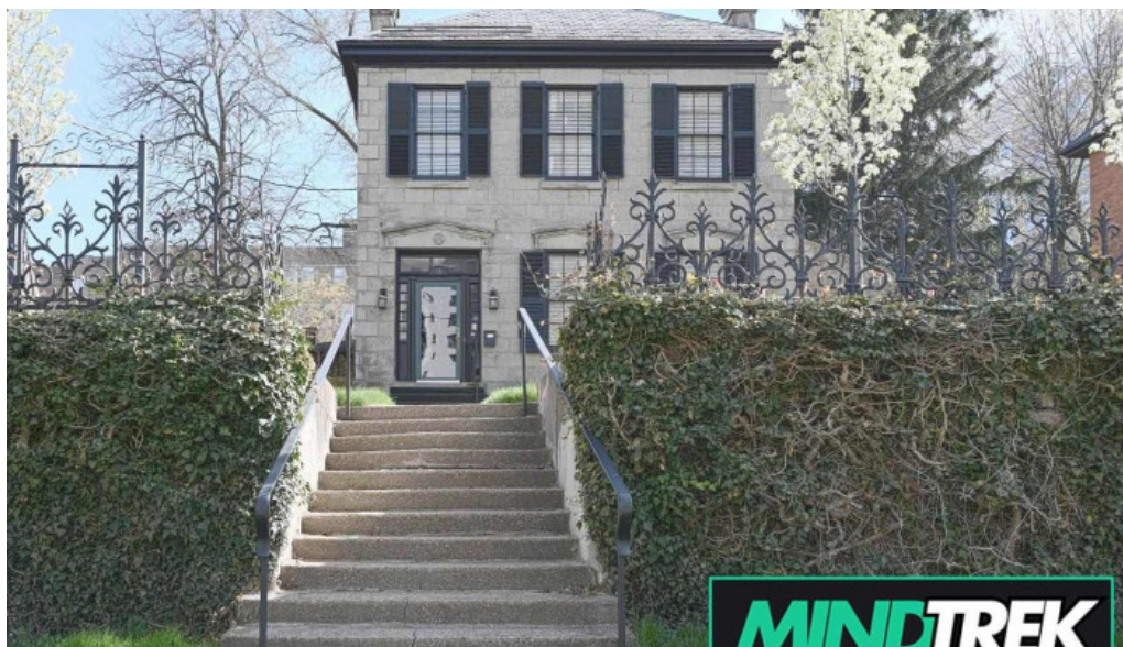
Bewell hamilton health centre hamilton