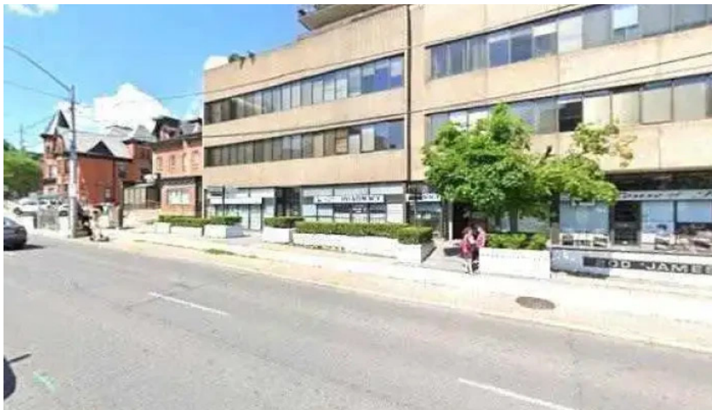
Seachange psychotherapy street view 360deg