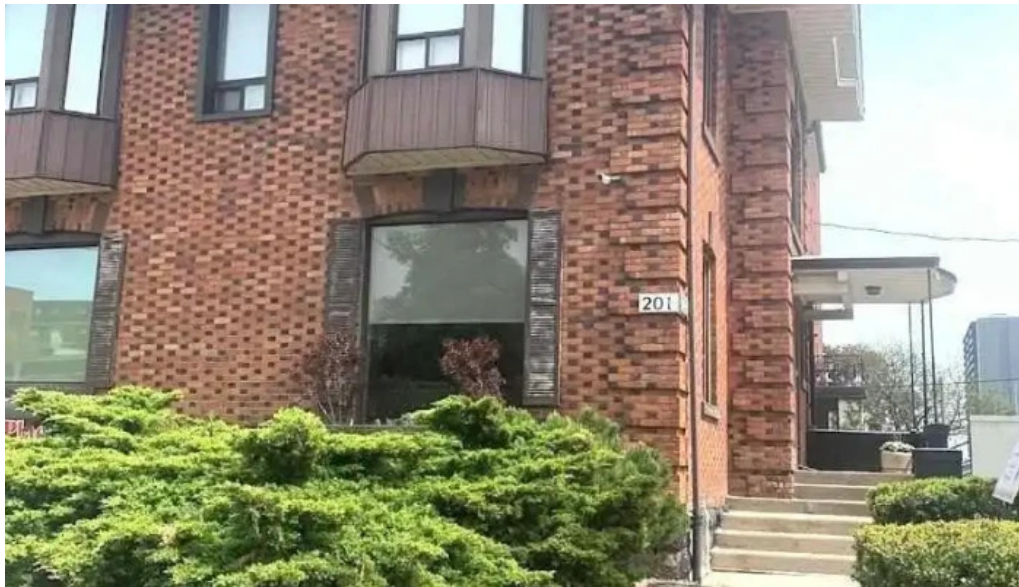
Seachange psychotherapy hamilton