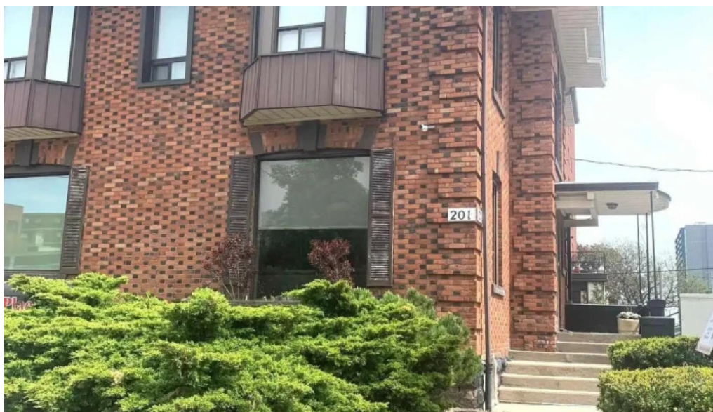
Seachange psychotherapy all