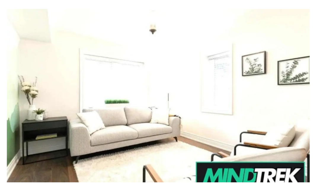
Healing recovery centre newmarket