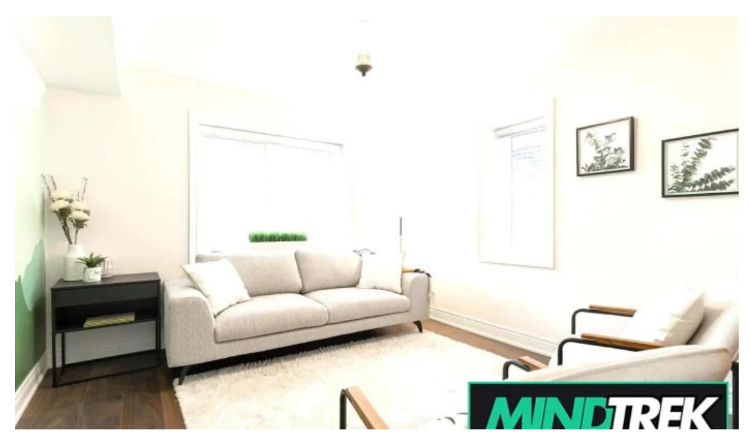
Healing recovery centre all