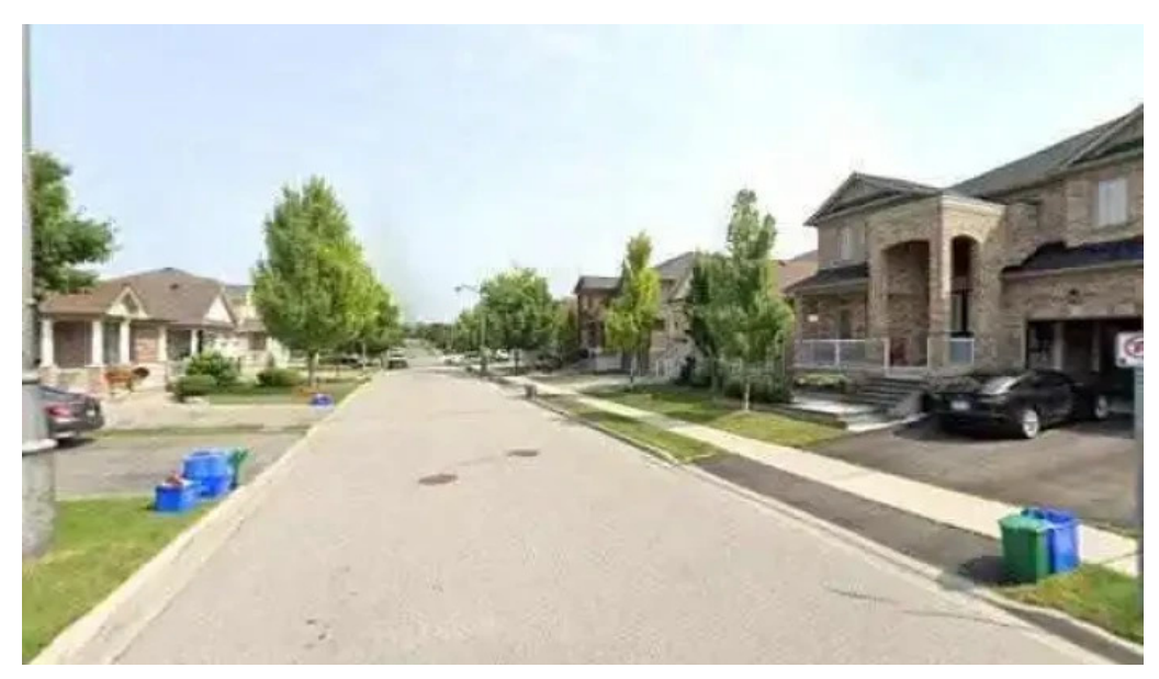
Healing recovery centre street view 360deg