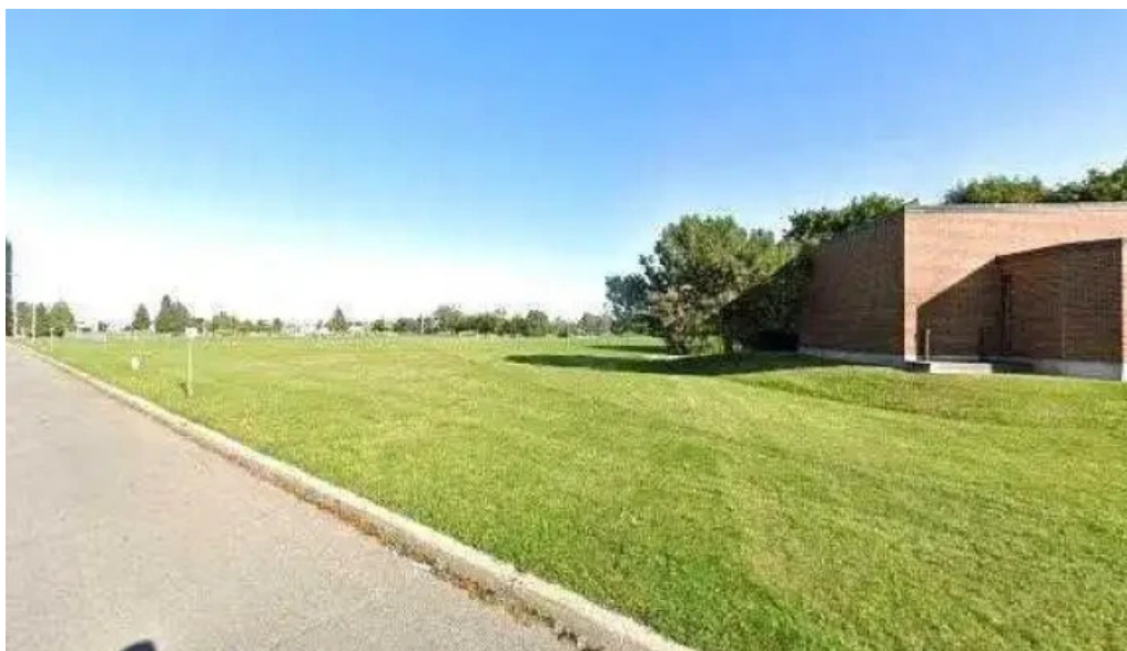
Ottawa psychotherapy services all