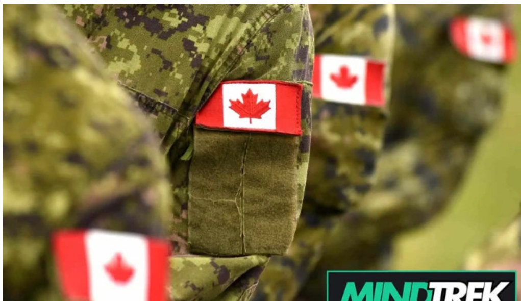
Ottawa psychotherapy services by owner