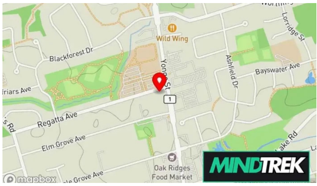
Goodfield mor and associates map