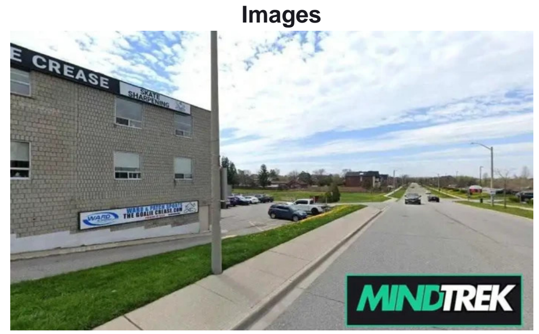
Goodfield mor and associates richmond hill

If you need to alter any detail that you think is incorrect regarding this page, we urge you to deliver a message so we can we will correct it as soon as possible. In advance we appreciate it.