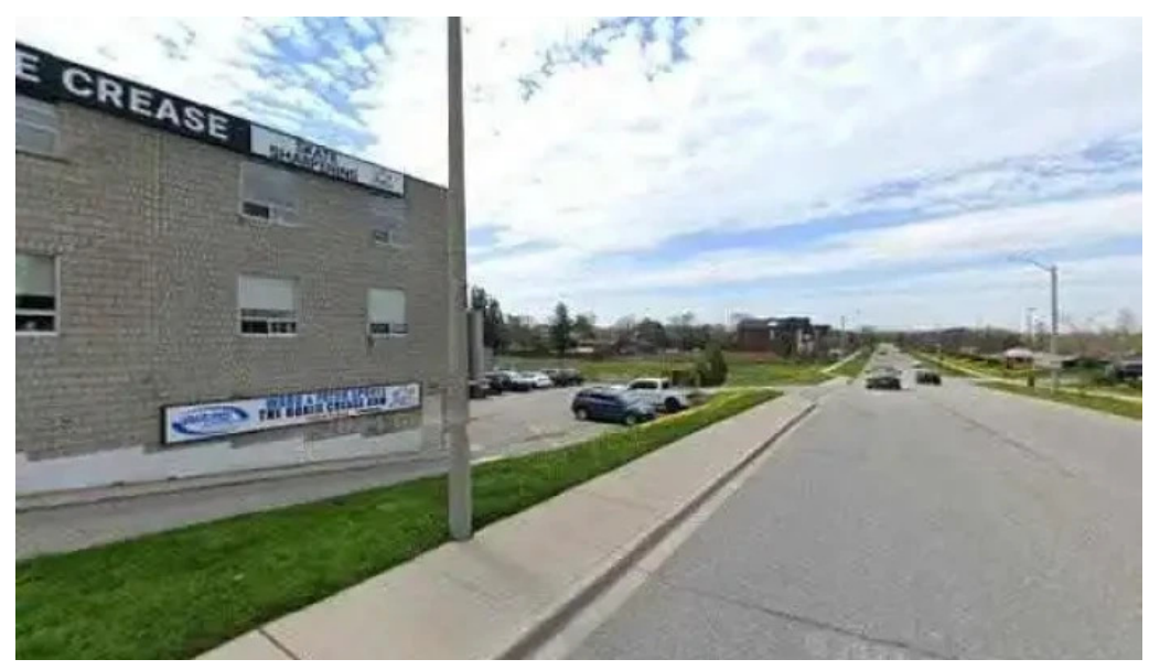
Goodfield mor and associates all