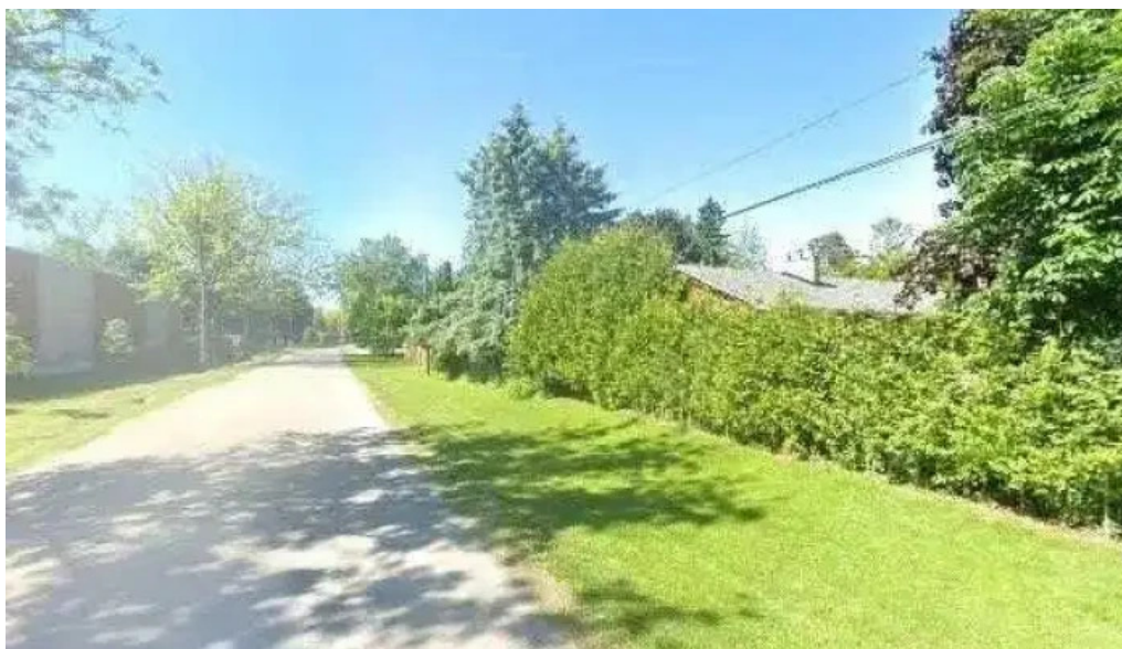
Vita psychotherapy and counselling services all