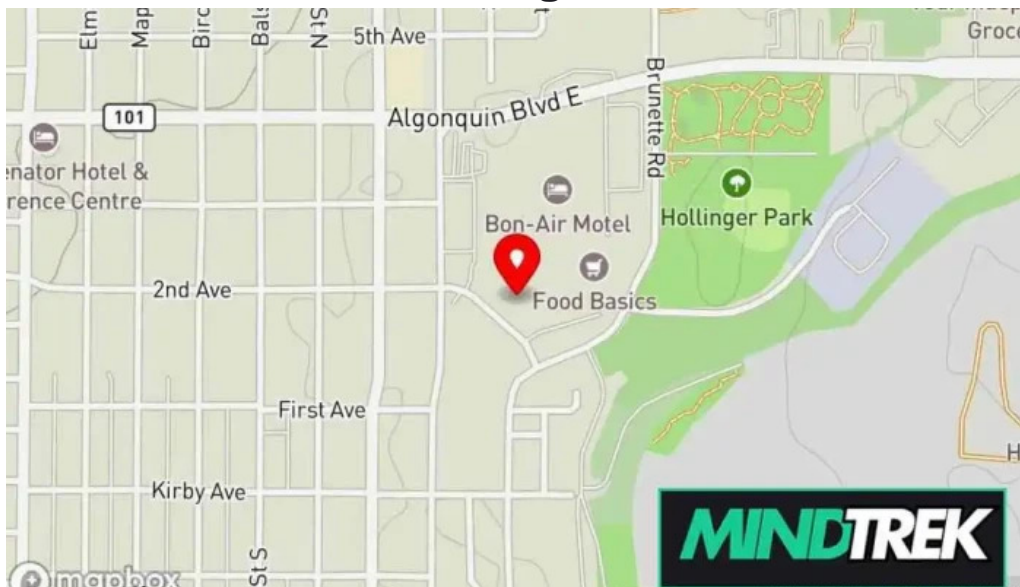
Cmha cochrane timiskaming timmins