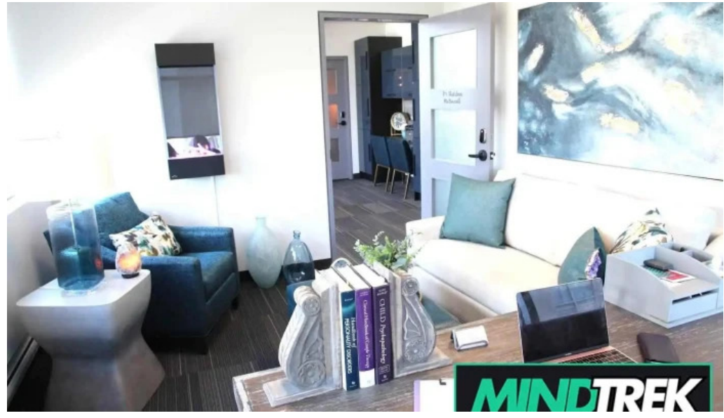
Psychologist toronto mcdowall integrative psychology healthcare toronto