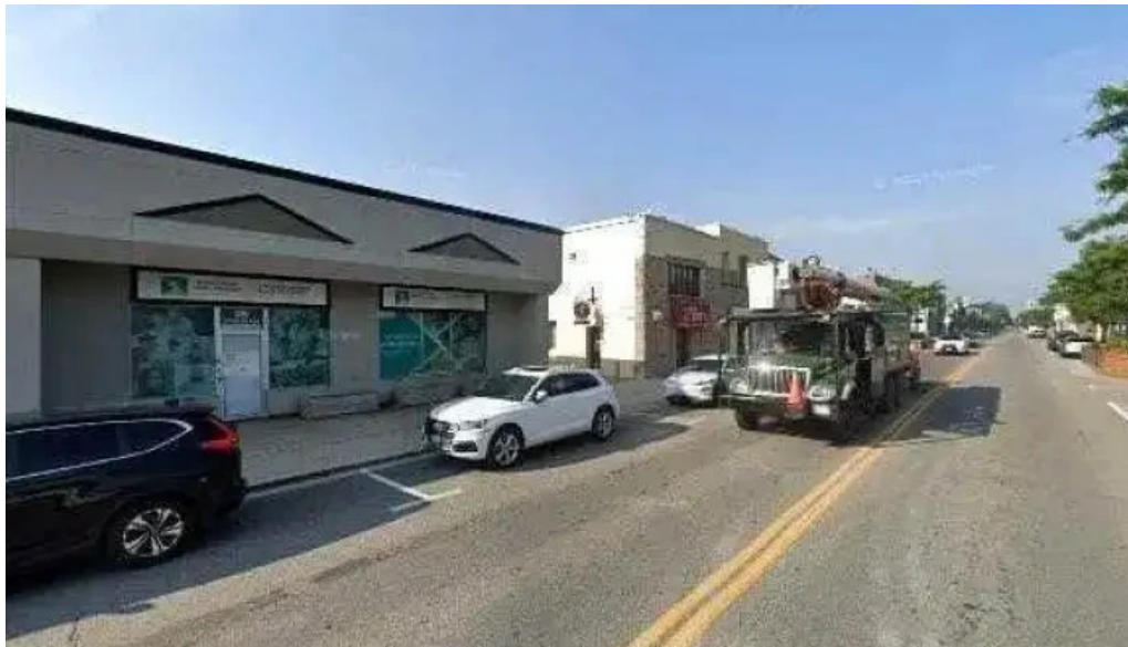
Canadian mental health association york region south simcoe alliston branch street view 360deg