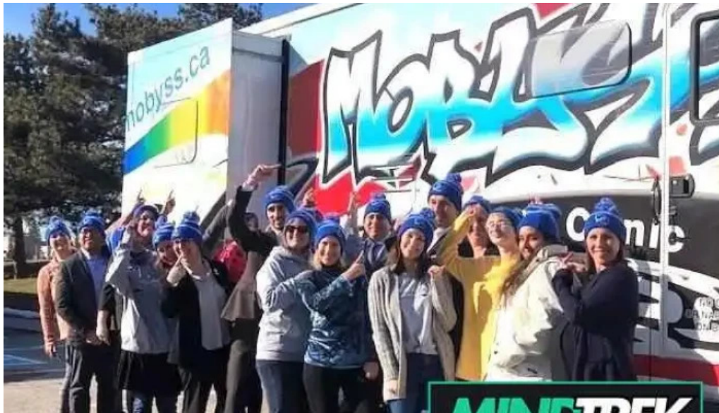
Canadian mental health association york region south simcoe alliston branch by owner