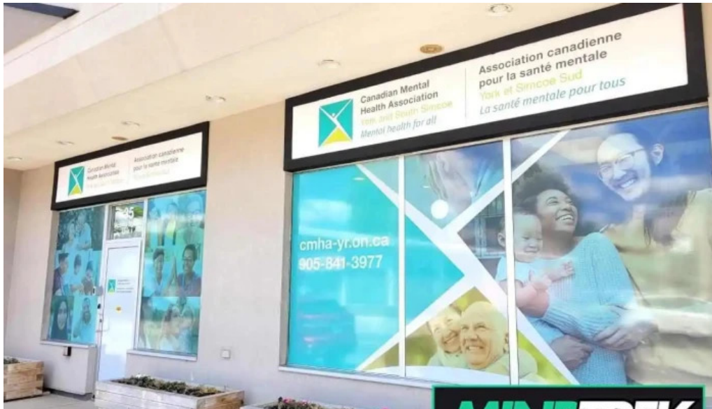
Canadian mental health association york region south simcoe alliston branch all