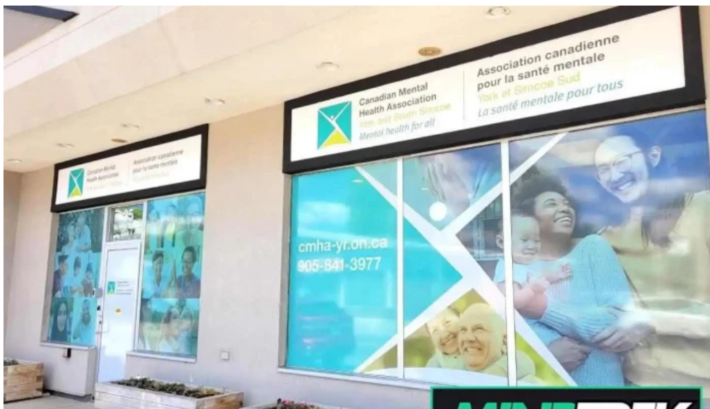
Canadian mental health association york region south simcoe alliston branch alliston