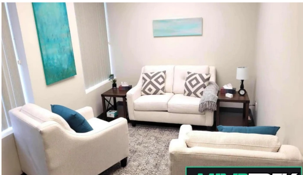
Simcoe county psychotherapy by owner