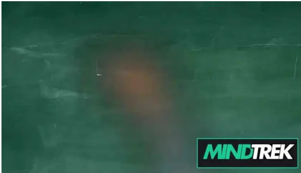
Nowwhat support services by owner