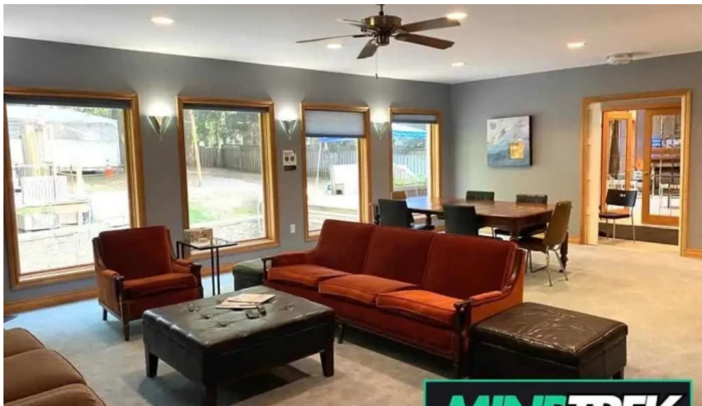
Nowwhat support services ancaster