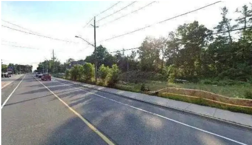
Nowwhat support services street view 360deg