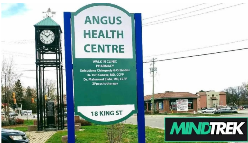
Zf psychotherapy angus