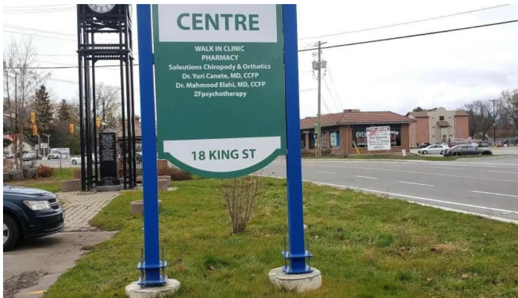
Zf psychotherapy by owner