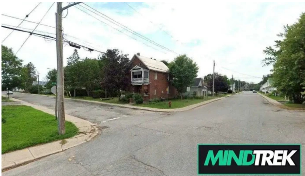
Mental health services of renfrew county arnprior arnprior