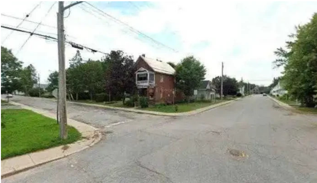
Mental health services of renfrew county arnprior all