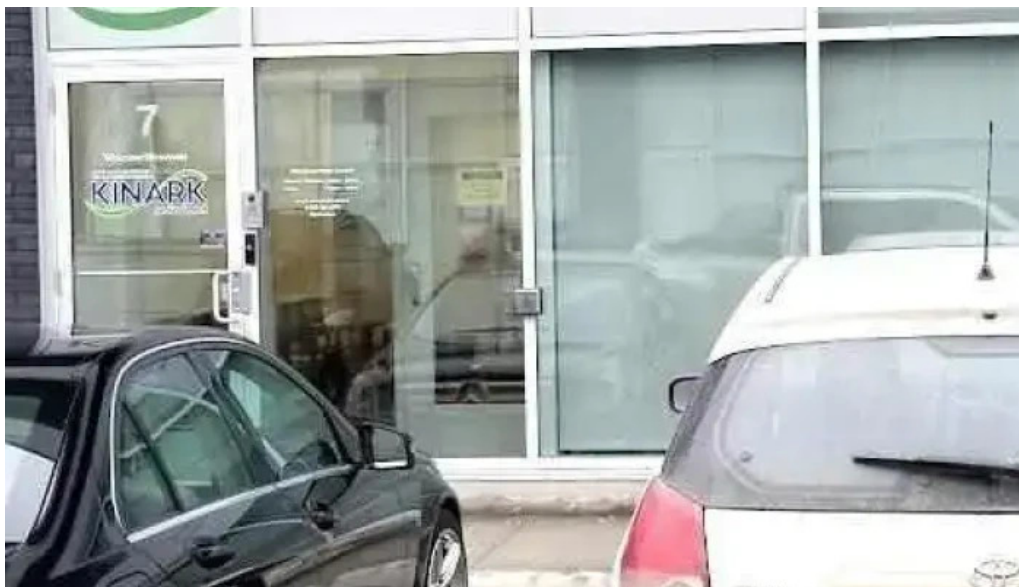
Kinark child and family services aurora