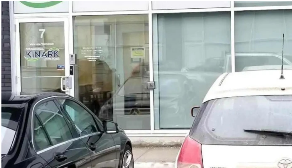
Kinark child and family services all