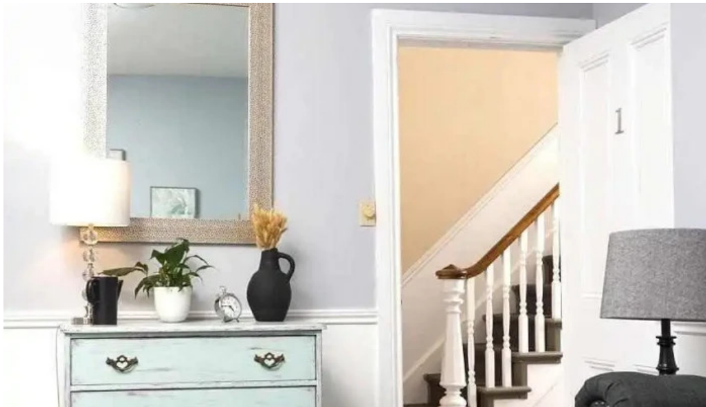
Balanced life therapy by owner