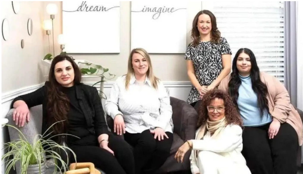
Balanced life therapy all