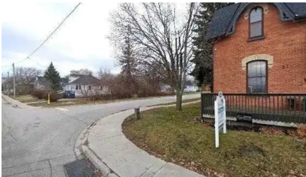
Balanced life therapy street view 360deg