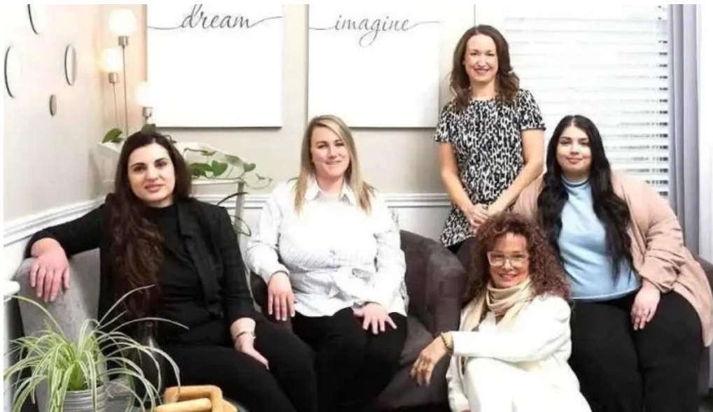
Balanced life therapy barrie