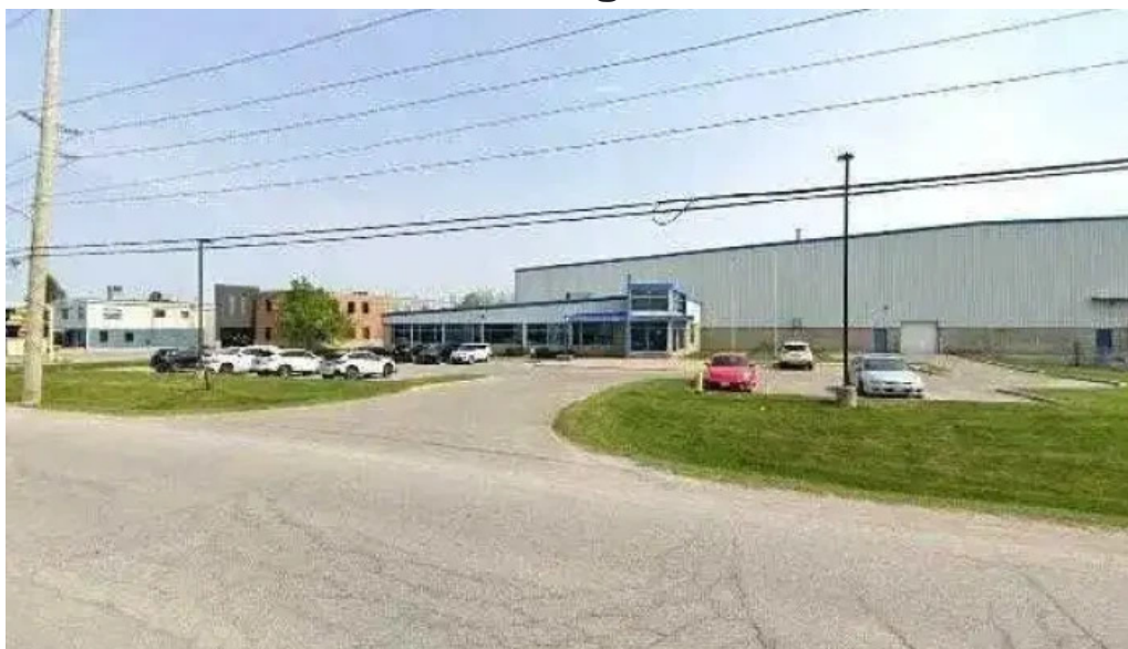
Family first play therapy centre street view 360deg