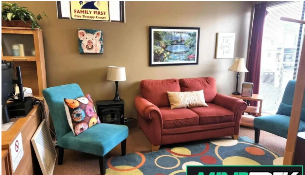
Family first play therapy centre all