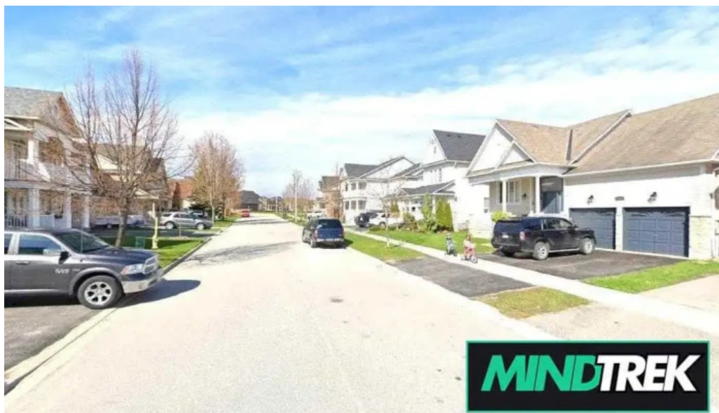
Mental health support barrie