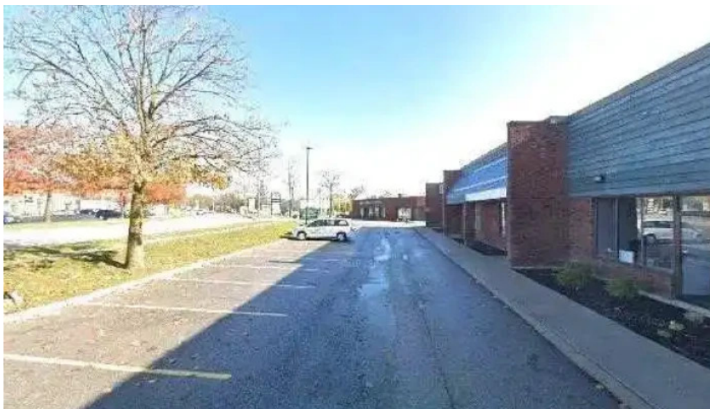
Trailhead psychotherapy clinic all