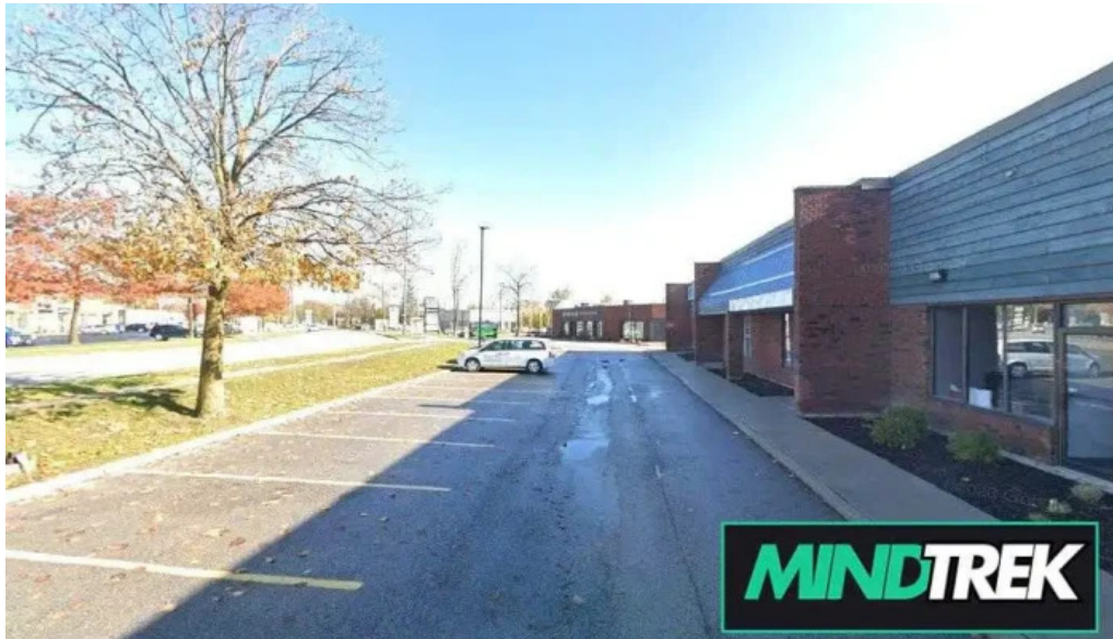
Trailhead psychotherapy clinic barrie