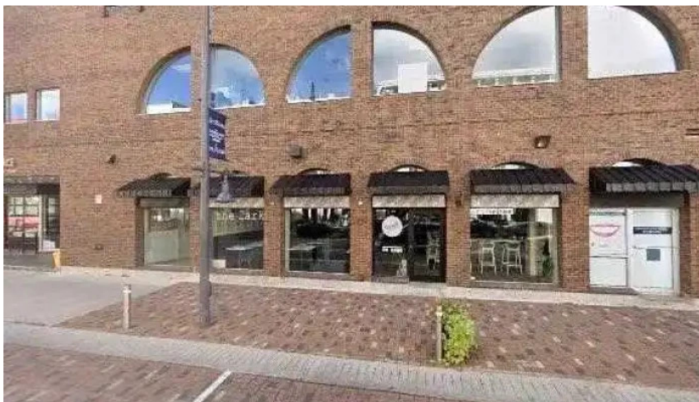
Bold therapy co all