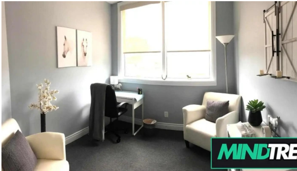
Brant mental health solutions brantford