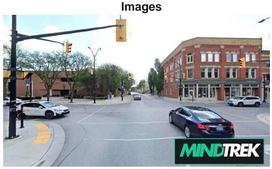
P a c e therapy and counselling services chatham

If you wish to modify any data that you consider is incorrect about this page, we ask forward a message and we will adjust it at the earliest convenience. Thanks beforehand we appreciate it.