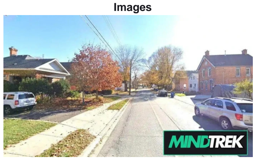
The mental health network of chatham kent chatham

If you need to adjust any data that you consider is not precise concerning this portal, we urge you to send a message so that we will correct it quickly. With anticipation thank you very much.