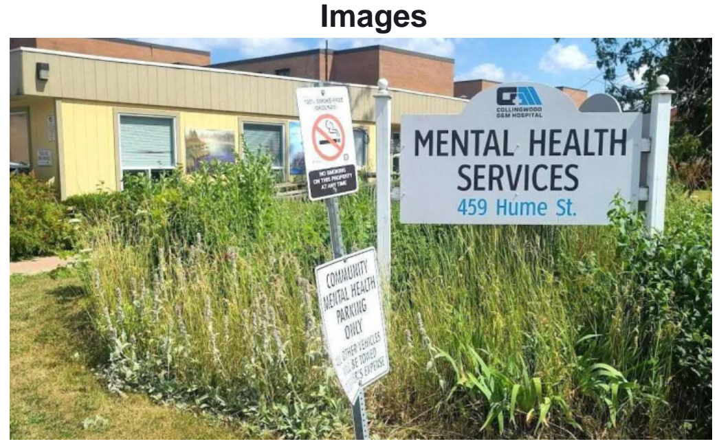
Outpatient mental health services collingwood

If you require to change any detail that you consider is not accurate about this portal, please send us a message so that we will fix it promptly. In advance thanks.