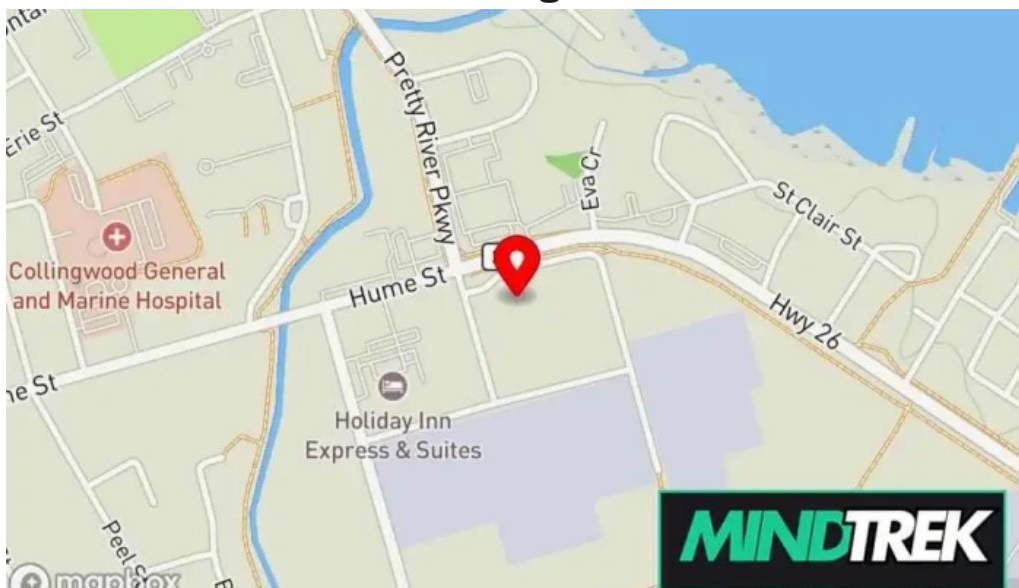
Sheila bristow map