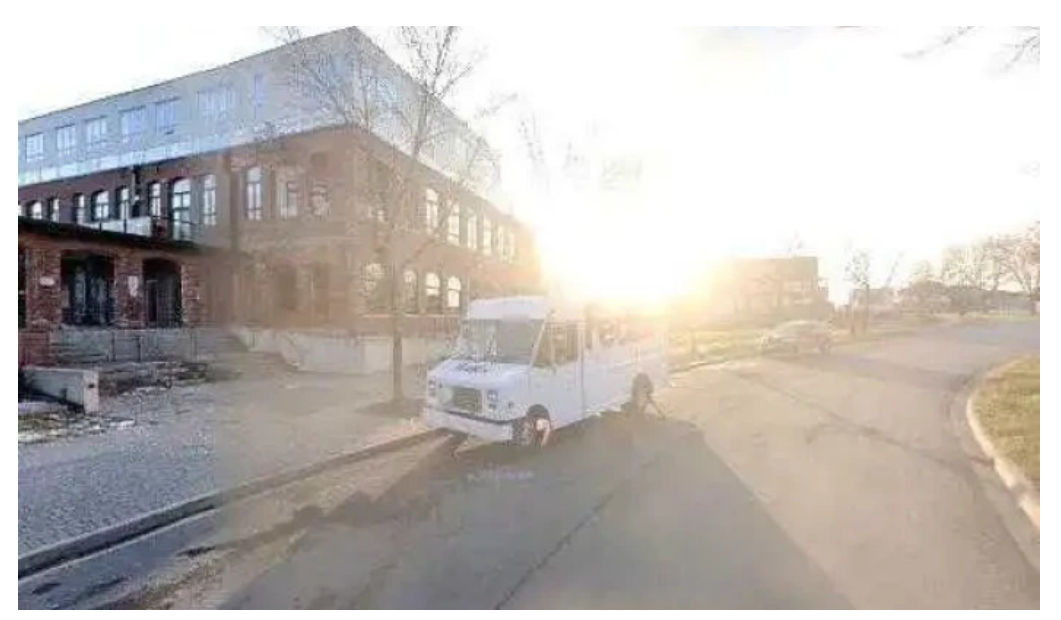
Cotton mill counselling clinic all