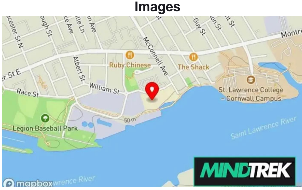
Cotton mill counselling clinic map

If you wish to update any data that you feel is incorrect concerning this site, we ask deliver a message so we can we will correct it promptly. In advance thanks for your cooperation.