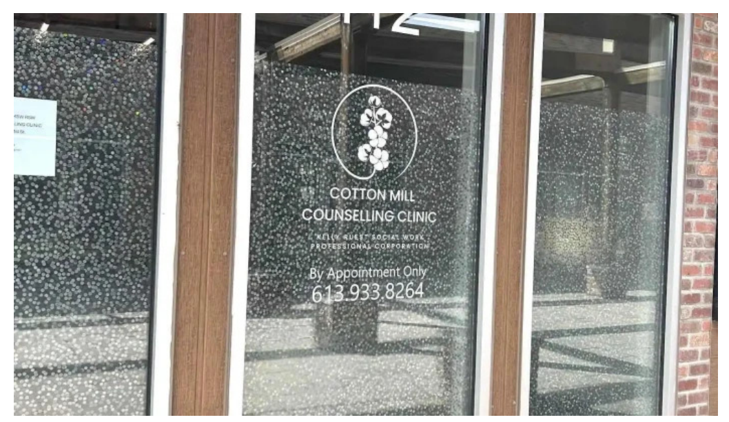
Cotton mill counselling clinic by owner