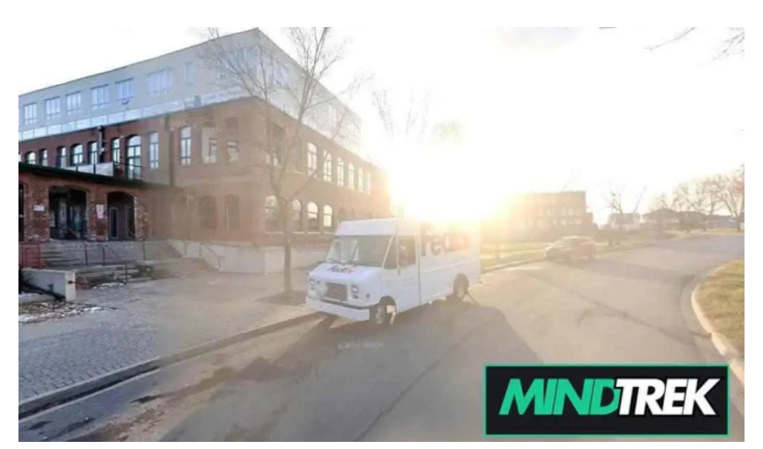
Cotton mill counselling clinic cornwall