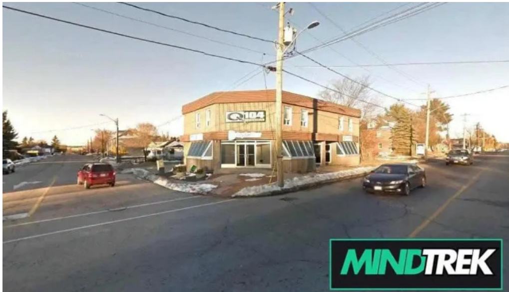
Bms thunderbird management and lifestyle consulting ltd dryden