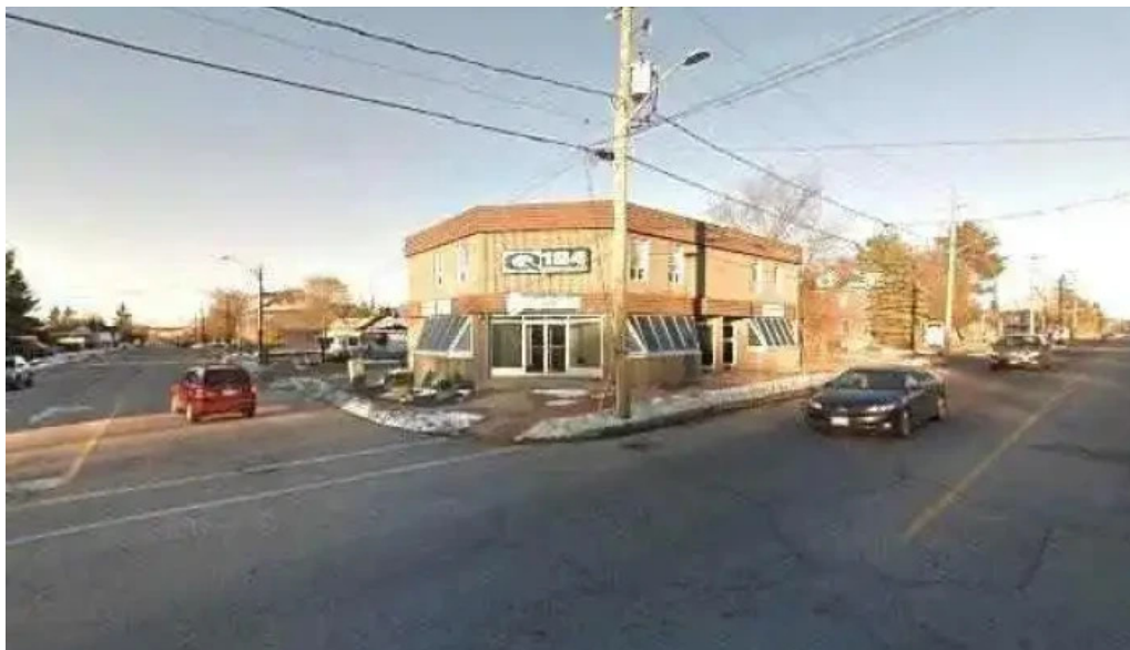
Bms thunderbird management and lifestyle consulting ltd all