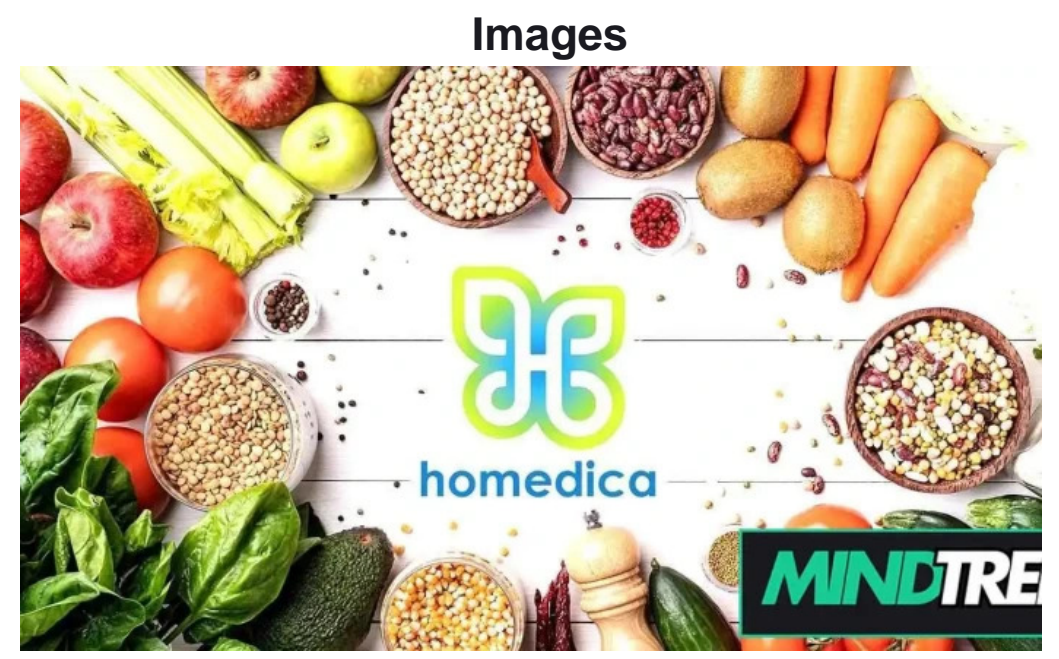
Homedica health family counselling nutrition etobicoke

If you need to adjust any element that you consider is not precise concerning this web, please forward a message so we can we will fix it promptly. With anticipation thank you very much.