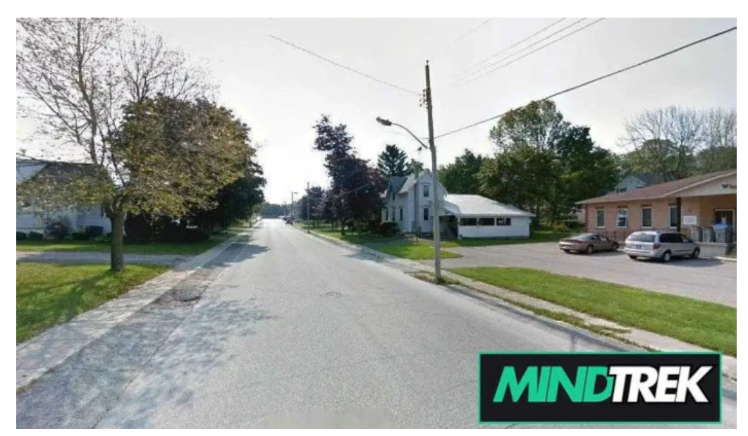
Clinton community psychiatric services goderich