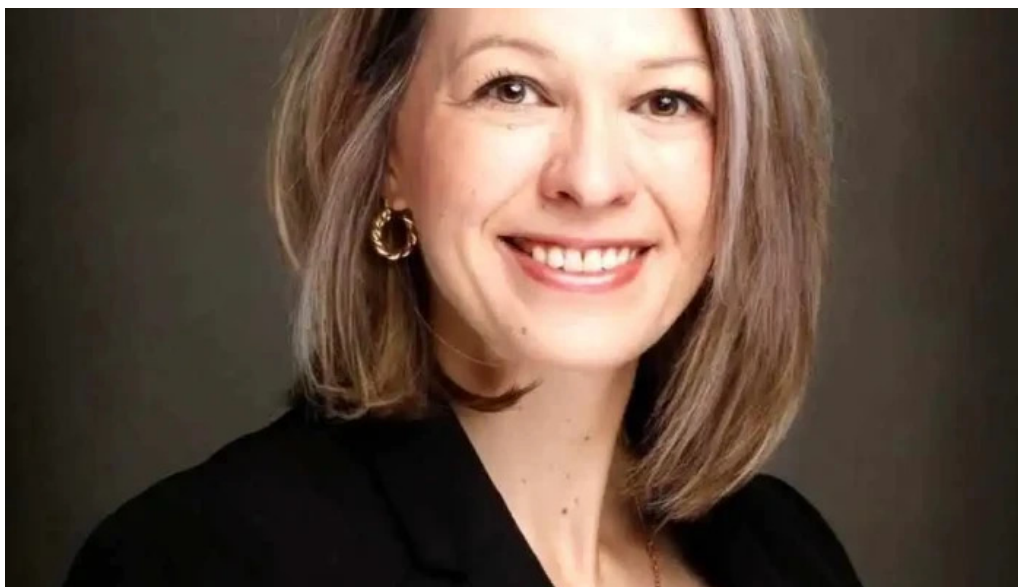
Chausse counselling services by owner