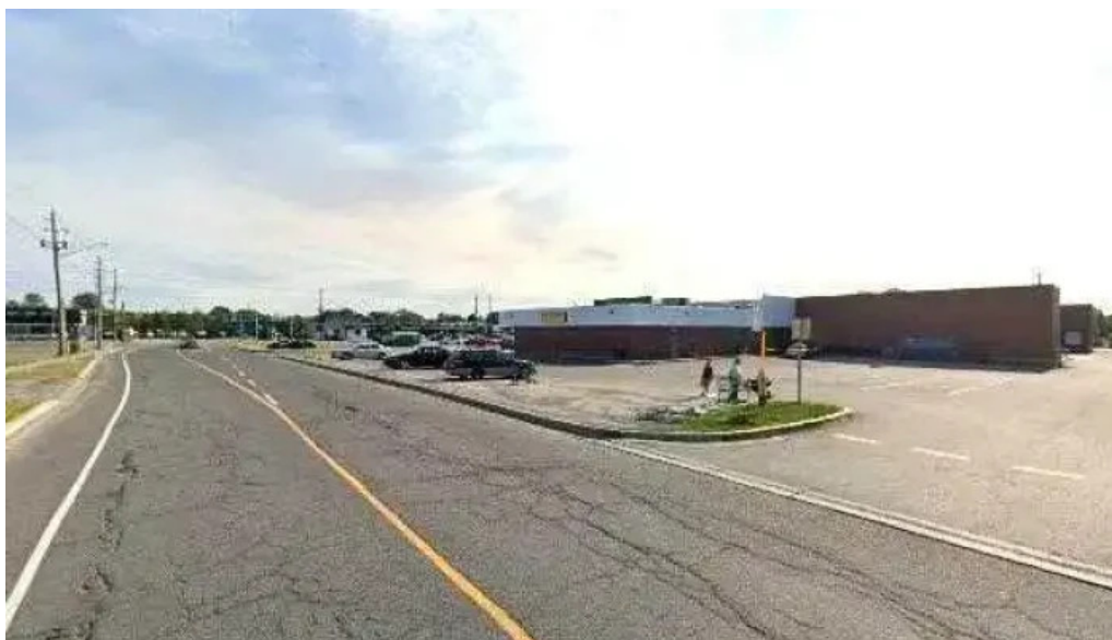
Chausse counselling services all