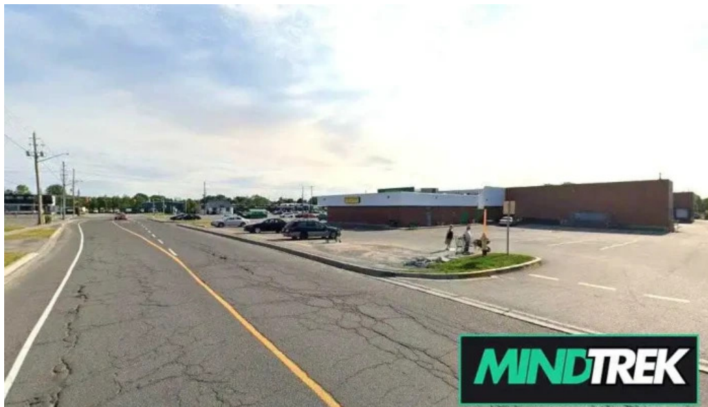
Chausse counselling services greater sudbury