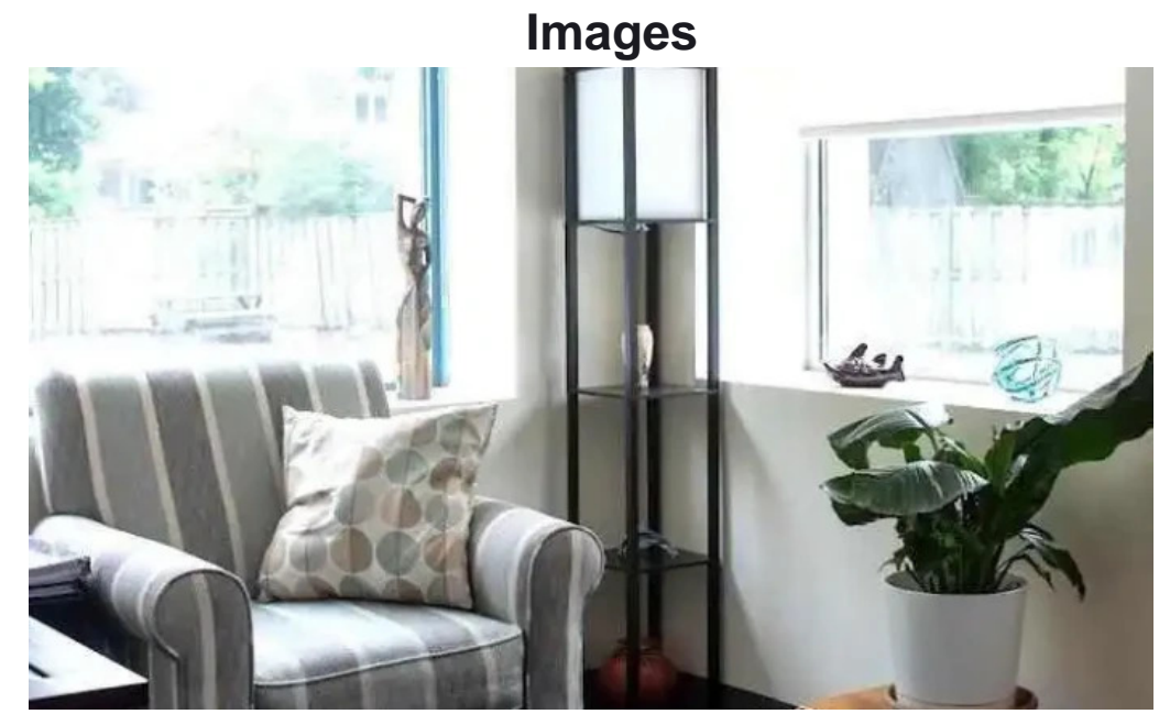
The trauma team guelph

If necessary to change any information that you think is not accurate concerning this page, we urge you to forward a message and we will fix it at the earliest convenience. With anticipation thanks for your cooperation.