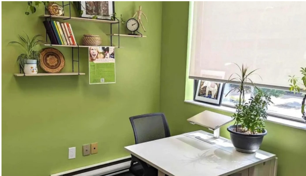
Access therapy by owner