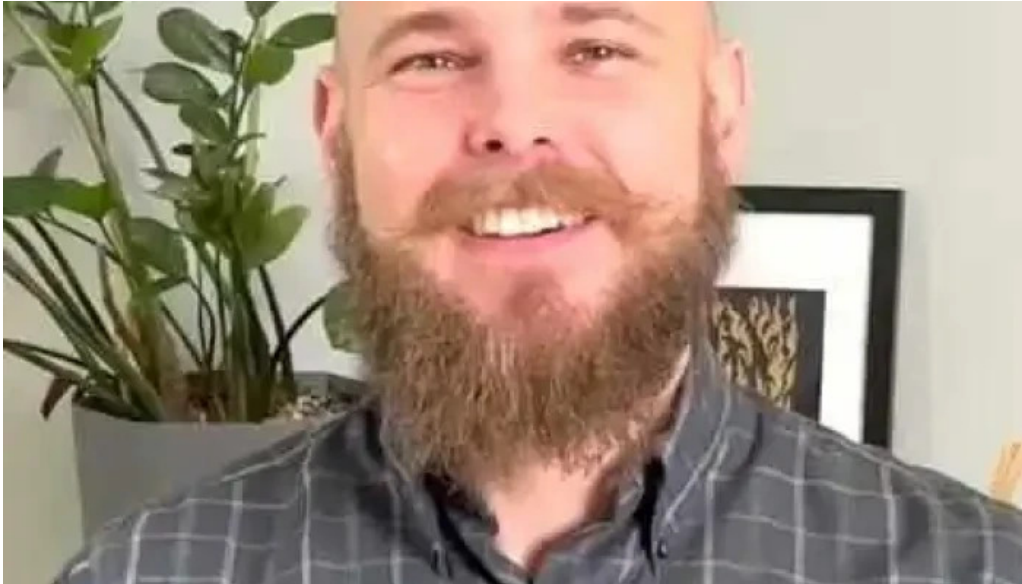
Access therapy videos