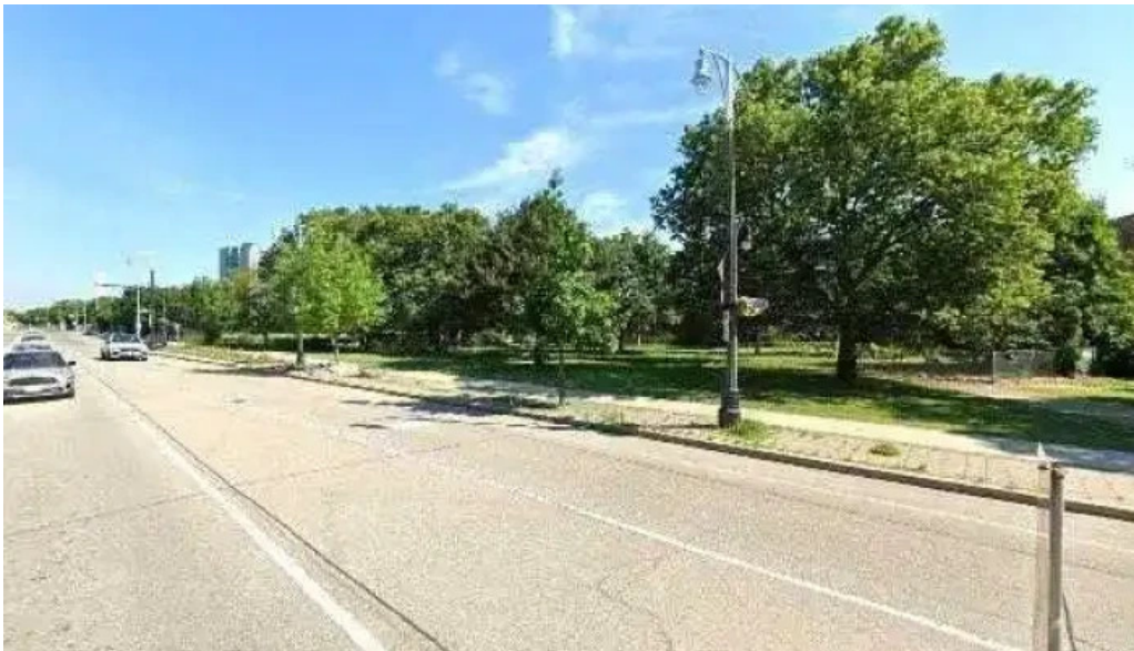
Access therapy street view 360deg