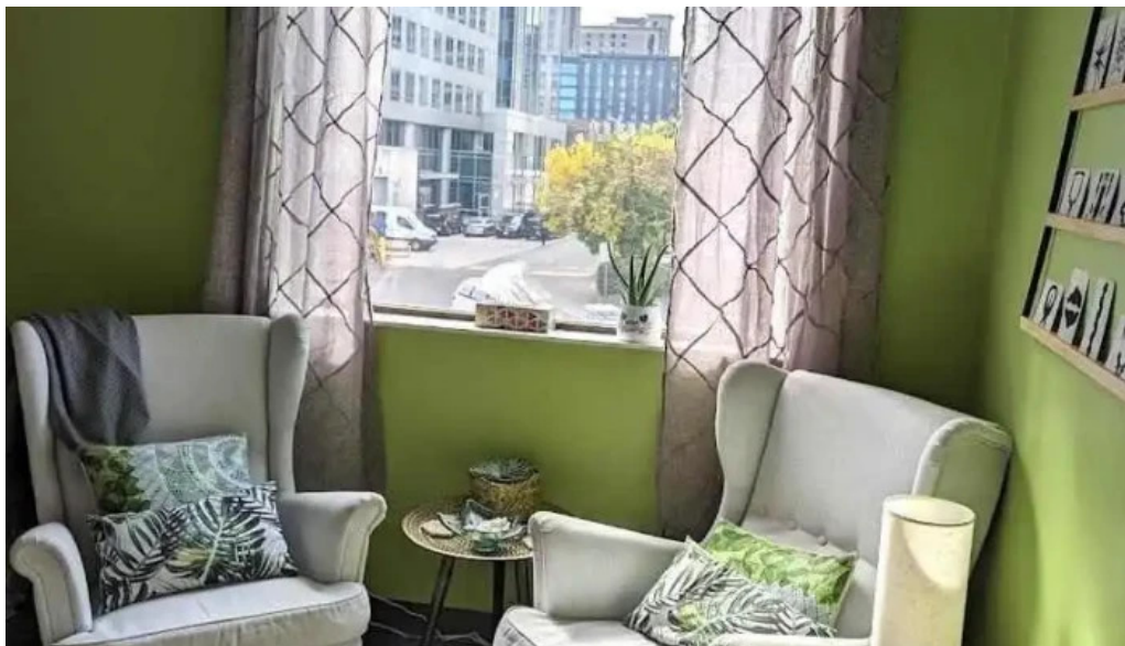
Access therapy hamilton