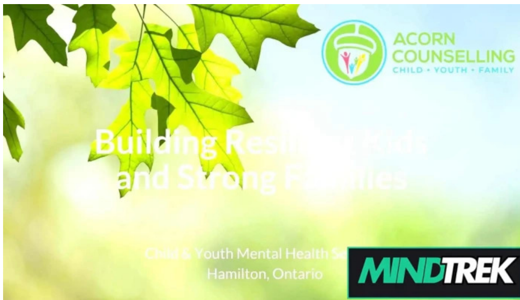
Acorn counselling all