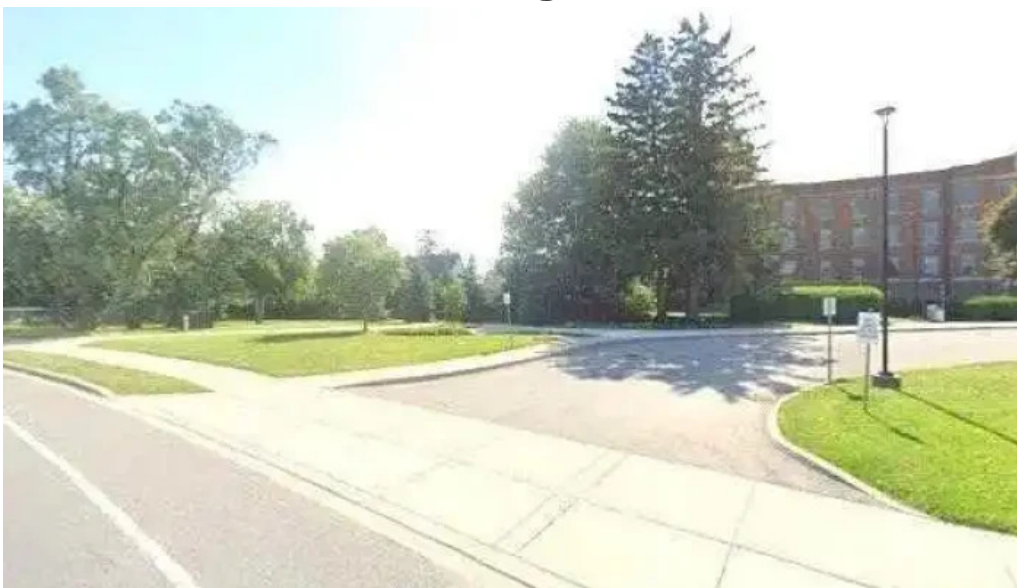
Acorn counselling street view 360deg