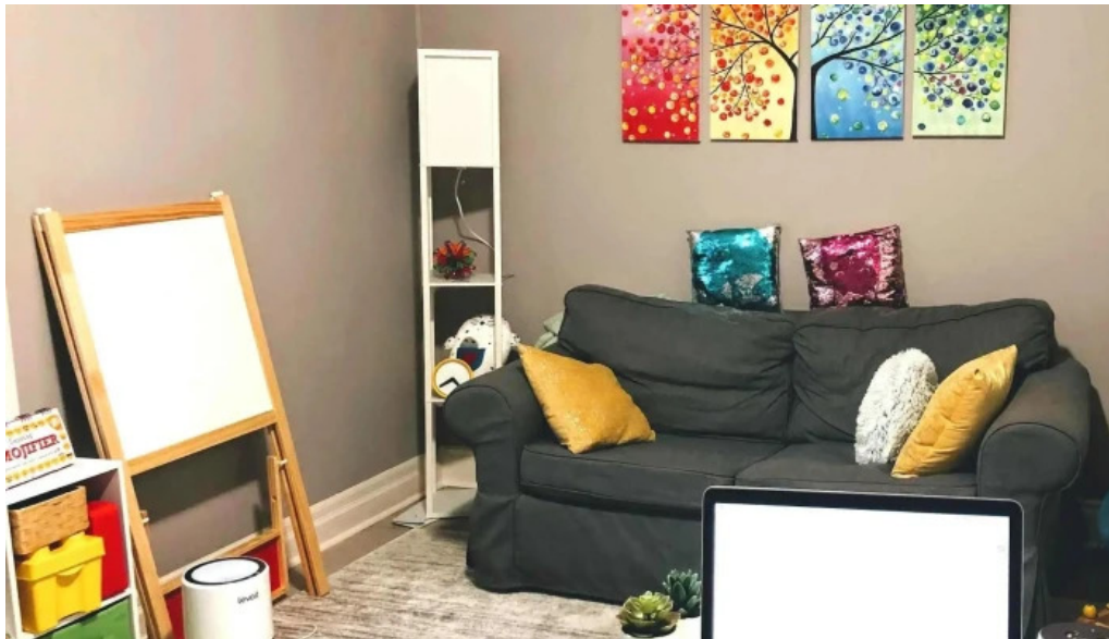
Acorn counselling by owner